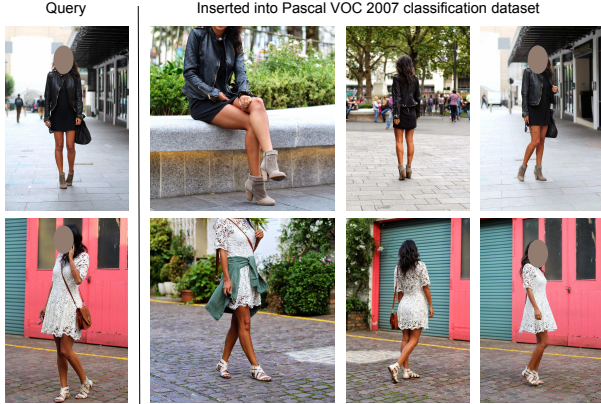
Figure 4: Examples of two shoes from StreetShoes . The left are the query images and the rest are inserted into Pascal VOC 2007 classification dataset [9] which provides distractor images. We only consider the shoe segment in the query example to ensure the target is clear.

the second fully connected layer of a CNN [22] as an additional feature, as it has been shown the activations of the top layers of a CNN capture high-level category-related information [47]. The CNN is trained using ImageNet categories. Second, we build a general category classifier to alleviate the potential problem of the deep learning feature, namely the deep learning feature may bring examples that have common elements with the query instance even if they are irrelevant, such as skins for shoes and skies for buildings. Combining the two types of category-level information with the category-specific attributes, the similarity between a query q and an example d in the search set is computed by