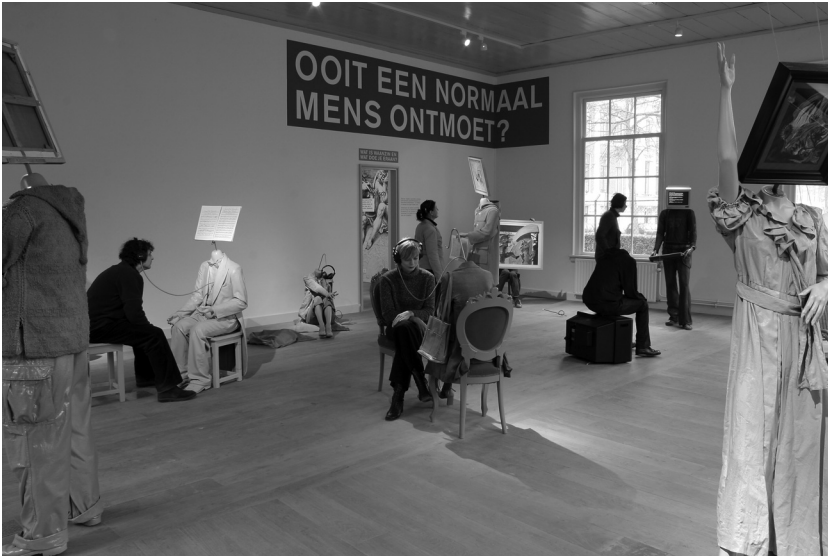
Listening to first-person narratives of mental distress. Dolhuys–Museum van de Geest, Haarlem, the Netherlands.

or identity of the speaker may influence the impact on visitors in significant ways—despite attempts to give equivalent presence to the voices of patients and practitioners, the power difference between the two in any medical encounter may play into visitors’ unequal perceptions of importance or validity, leading them to favor one account over another. Dramatized readings of written accounts may be especially unconvincing for some, and therefore less persuasive than “real” archival audio traces, especially if readings sound like a performance rather than an authentic voice from the past. 37 Simply playing different perspectives side-by-side also misleadingly creates a supposed dialogue out of statements that were previously monologues.