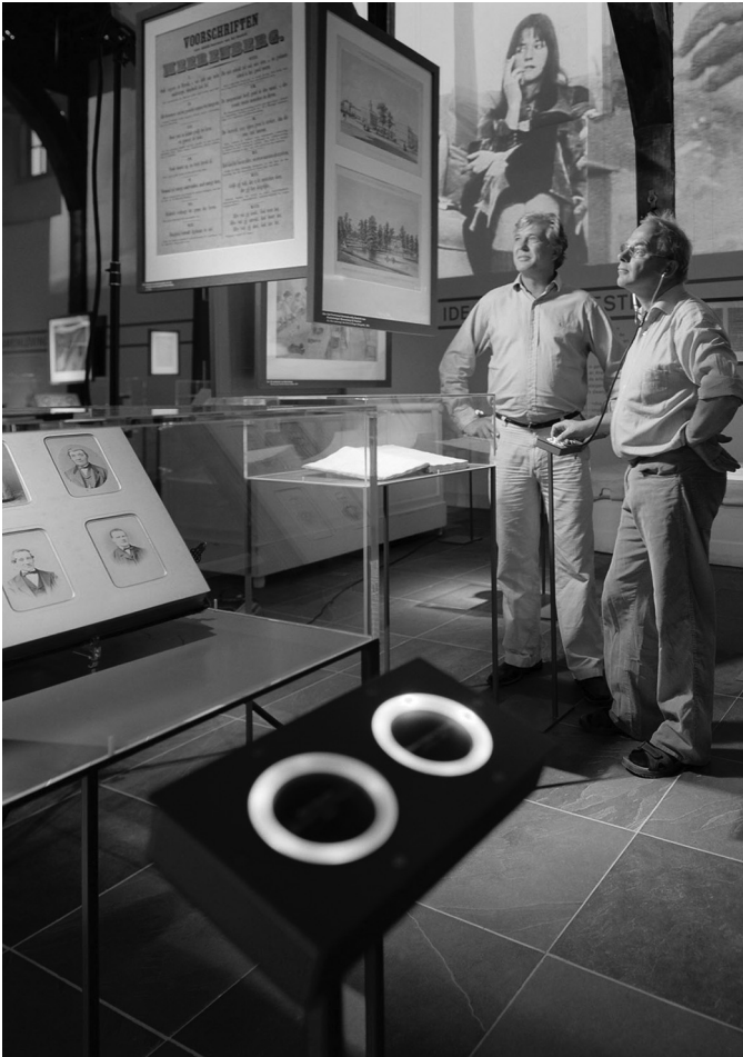
Listening station in the main exhibition hall. Dolhuys–Museum van de Geest, Haarlem, the Netherlands.

patients or practitioners. The visitor, wearing a stethoscope collected at the entrance, places the end of the stethoscope on the listening station to hear a clip. The stethoscope headset is an odd and ill-suited choice, as it is not used for mental health diagnosis; the earpieces are also uncomfortable to wear.