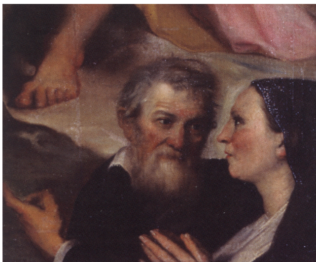
2a. Federico Barocci, Madonna di San Simone , 1567, Urbino, Galleria Nazionale delle Marche; b. detail of the donors’ faces, executed in oil on paper and glued to the finished canvas.