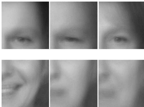
Figure 3: Average face regions corresponding to different hidden states (from left to right) for the bottom and top face regions.