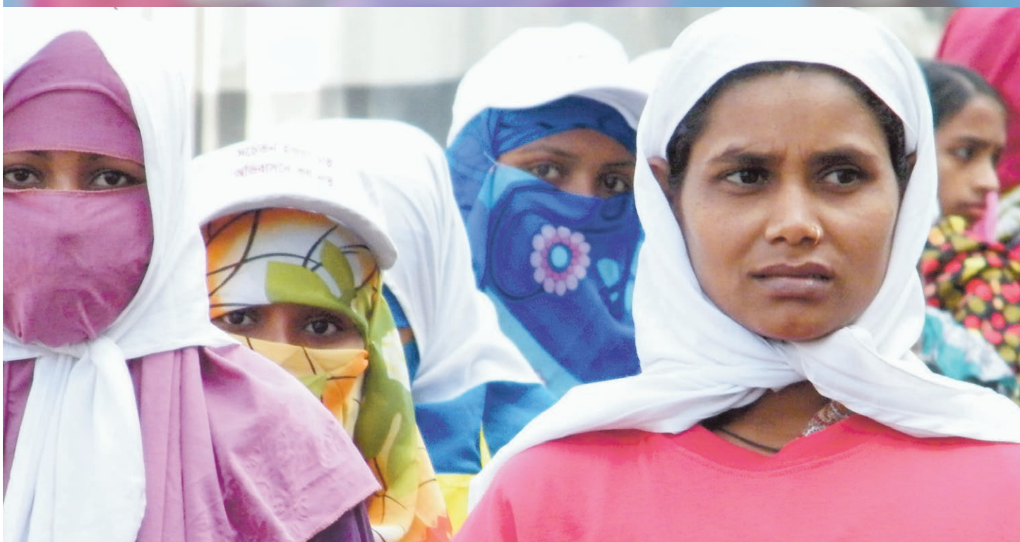
Above: Protestors against gender violence, India.

The other dilemma is that while the human rights approach has succeeded in eliciting a state response to domestic violence, criminalisation must also include preventive and protective support measures. However, there is still scant recognition that violence is intrinsically related to gendered inequality between men and women, a conceptual flaw that would need to be addressed all over the world.