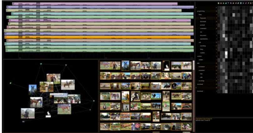
Figure 2: Overview of the ChronoSphere system. With the top-left window showing cluster distribution over time, the bottom-left holds the graph based visualization and the rightmost window the heatmap showing cluster distribution over different directories.