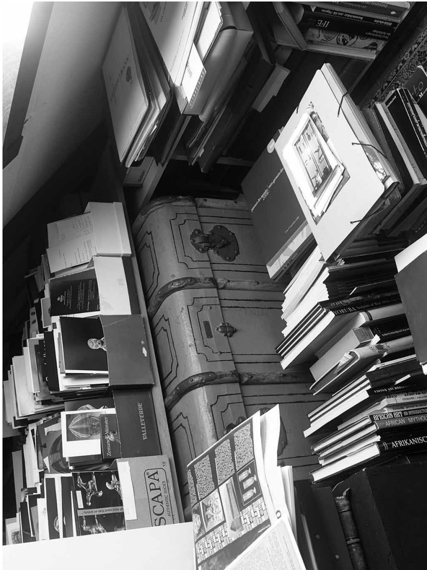
Interior of the house of the collector, filing system.

Sara van der Heide's 24 European Ethnographic Museums (2010) is presented in the winter garden. The work consists of a series of twenty-four drawings collecting the names of ethnographic institutions all over Europe. In bringing these names together, the artist invites us to consider what the ritual of naming involves and reflects: colonial legacy, scientific motives, and current politics.