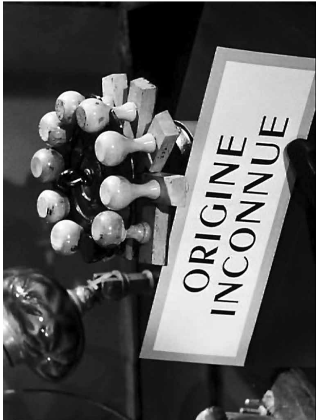
Still from Les statues meurent aussi , Chris Marker & Alain Resnais, 1953. Présence Africaine, Paris.