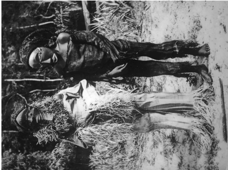
Photograph taken in 1909 at Malassa during the second expedition of Emil Torday in the Congo. Reproduced in John Mack, Emil Torday and the Art of the Congo 1900–1909 . London, British Museum, 1990, p. 35.