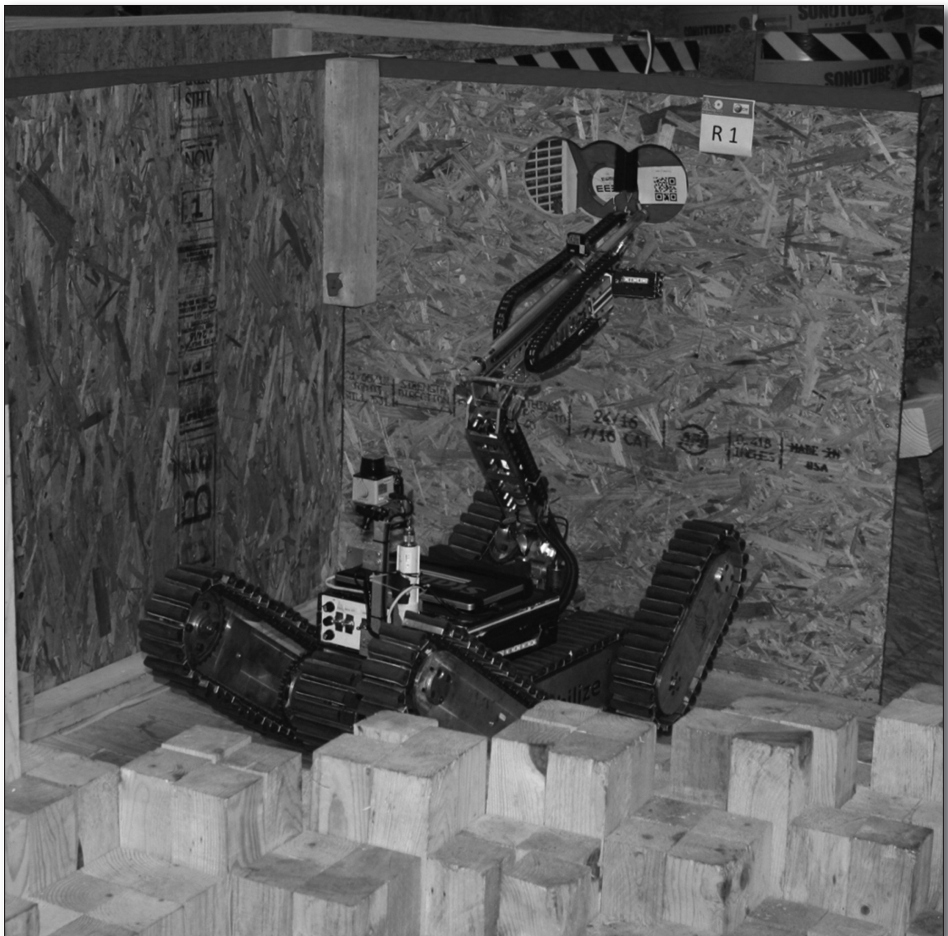
Figure 1. Rescue Robot of Team Stabilize from Thailand Inspects a Simulated Victim near a Step Field at RoboCup 2012.

Operating System (ROS) that makes the best algorithms broadly reusable, thus enabling the new teams to reach quickly the world class performance level. 1