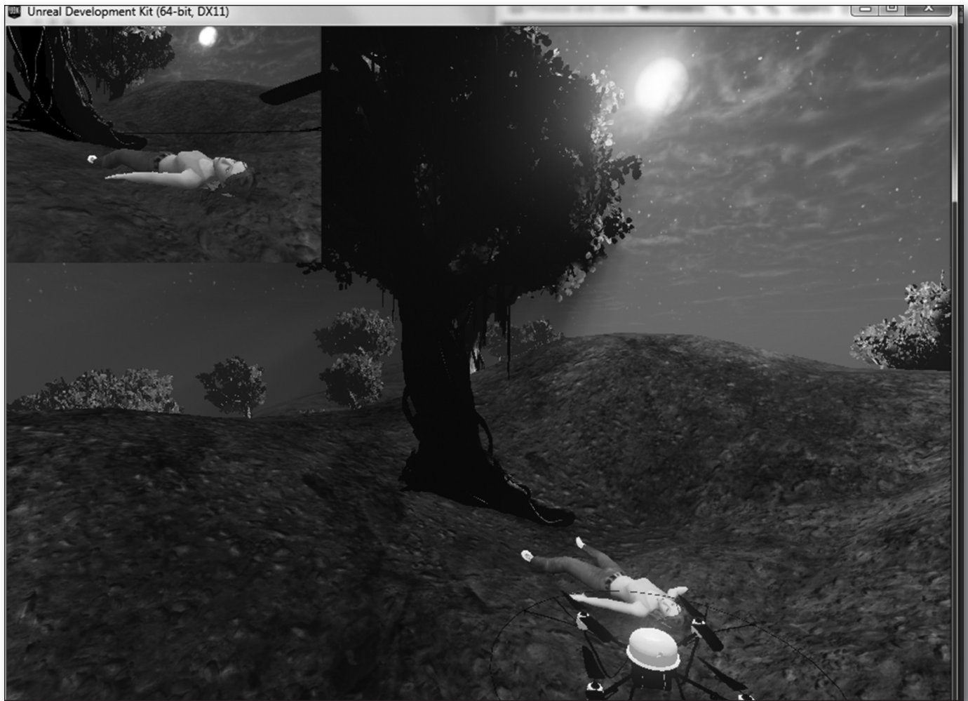
Figure 4. Outdoor Scenario for the Virtual Robot Competition in the Dutch Open Final 2012.

whether or not one of the robots has detected a victim (based on color or shape). Due to poor lighting and the number of occlusions, the conditions are generally not favorable for automatic victim detection, and manual confirmation is always needed. The approach to a victim is quite critical (the robot should come within the communication range [ < 1\text{m} ] but is not allowed to touch the body or any of the limbs). This means that the workload for the operator is quite high, providing an advantage for the teams that are able to automate the decision making within the robot team as far as possible and involve the operator only when needed.