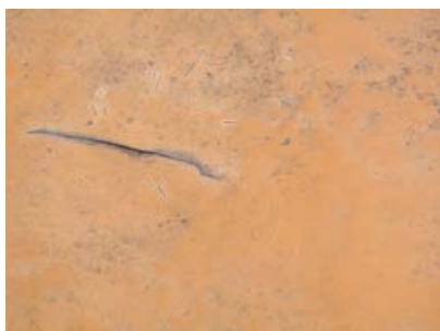
Figure 6. Detail of cracked GRP on the roof of the master unit, Photo: Sanneke Stigter

The colourful glass fibre reinforced polyester (GRP) resin has faded, especially on the roofs of the master and kitchen unit, due to their direct exposure to sun and rain. The once deep green sanitary unit now shows a pale milky hue on the rounded top where sunlight hits the surface and in places where water runs down. The red kitchen unit has faded into a dull brownish orange and shows curved cracks in an area where the water would stand. The striking yellow blob is chalking, a well-known phenomenon on polyester surfaces. The once transparent skylights discoloured to amber brown. The GRP on the roof and skylights suffered most. A combination of extreme fluctuations in temperature, rain, sun, occasionally snow and dirt from leaves, bird excrement, algae and moss have damaged a large part of the top coat of polyester. Capillary action allowed water and dirt to enter the voids that appeared between the glass fibres and the polyester resin as well as the cracks on the roof (Figure 6). This caused physical and chemical deterioration that damaged the overall structure of the artwork.