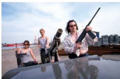
Figure 4. Joep van Lieshout and crew, Photo: ©Atelier van Lieshout