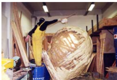
Figure 5. Making of the sleeping unit, pouring expanded polyurethane foam over an air pumped bulb of polyethylene sheeting shaped by self-adhesive tape, the basis for a hand lay-up polyester finish, Photo: ©Atelier van Lieshout

structures created with polyurethane foam including the sleeping unit (Figure 5). A moulding technique is used to create shiny surfaces. To form the skylights a technique has been developed to make use of gravity. A sheet of polyethylene is hung from a framework to form a curved shape from an inverted skylight. This is covered with glass fibre mats and polyester resin and, after curing, the supporting sheet is removed. Bubbles and folds in the transparent skylights reveal the handwork and the AVL touch. The book promotes the idea that the art-making process is not restricted to the artist or his studio.