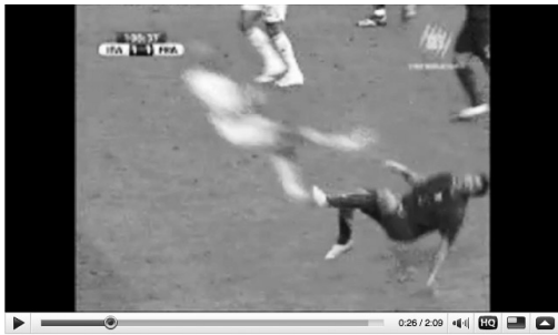
37 Zidane vs. Materazzi

and interrelation change the depiction as well as the communication related to sports in a more profound way. While such online formats as live tickers, sports portals or fan chats feature modes of knowledge production quite similar to those of television sports—in fact, they are based on the knowledge and also the imaginations generated by television 21 —YouTube features dynamics that just don't fit media sports. The heterogeneous relations built up inside YouTube detach the sports clips from the modes of communication established by other media.