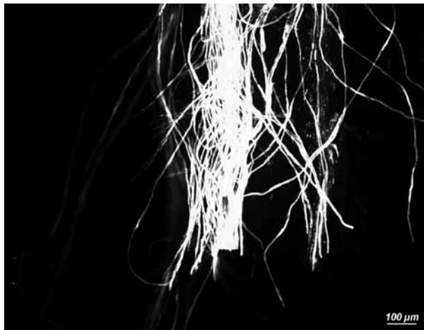
Fig. 1. The base of the style with many pollen tubes in the self-compatible apricot cv. Silvercot