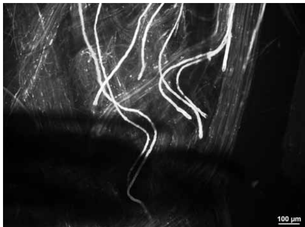
Fig. 3. Incompatible pollen tubes with swellings at the tips in the middle part of the style in the self-incompatible apricot cv. LE-8311