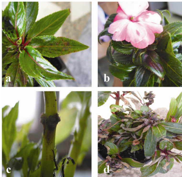
Fig. 1 Symptoms on I. hawkerii Bull. plants infected with TSWV. (a) Speckled necrotic spots and flecks. (b) Flower mottling, and necrotic line pattern of leaf. (c) Brown to black lesions along the stem. (d) Tip necrosis and plant declining.

Tissue culture is an important method of plant regeneration and obtaining disease-free ornamental plants (Faccioli, 2001; Rout et al. 2006). No effective chemical treatments are available for the managing TSWV under greenhouse conditions. Hence, effective elimination of viruses and maintaining of virus-free planting material are important for control of viral disease in plant production. Meristem culture is useful for obtaining virus-free plants from a wide range of important crops (Grout, 1999). The main reason for using meristem-tip culture to eliminate pathogens is due to the fact that many pathogenic organisms fail to invade the meristematic region of shoot tips because the multiplication of cells in meristem is faster than multiplication of pathogens. A second advantage of this type of culture is high genetic stability of regenerated plants with low somaclonal variations, as the clonal propagation takes place without callus interphase. The development of efficient in vitro regeneration method for I. hawkerii probably will have strong impacts on new cultivars of this popular ornamental plant.