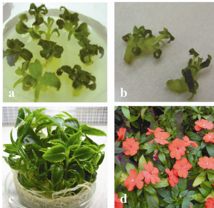
Fig. 3 In vitro propagation of virus-free I. hawkerii Bull. (a) Shoot formation on MS medium after culturing for 2 weeks. (b) Hyperhydric shoots developed on medium with 1.0 \mu\text{M} TDZ. (c) Well developed in vitro plantlets after 4 weeks of culture on the medium with 0.01 \mu\text{M} CPPU. (d) Acclimatized plants maintained under greenhouse conditions.

The in vitro regeneration of I. hawkerii from explants grown on the MS medium supplemented with different cytokinins at varying concentrations is presented in Table 1. All concentrations of CPPU and TDZ facilitated axillary shoot differentiation, but CPPU was more efficient than TDZ, efficiency was measured in terms of average number of shoots, average shoot length, shoot fresh and dry mass. Among the various concentrations of CPPU and TDZ tested, 0.01 CPPU produced the highest number of shoots (7.3). Shoot elongation was inhibited as cytokinins concentration increased (Table 1). The fewest but longest shoots were stimulated with CPPU at 0.01 \mu\text{M} (Figure 3c). Micropropagation of I. hawkerii Bull. has been reported by culturing shoot tips which yielded very few shoots (Han and Stephens, 1987).