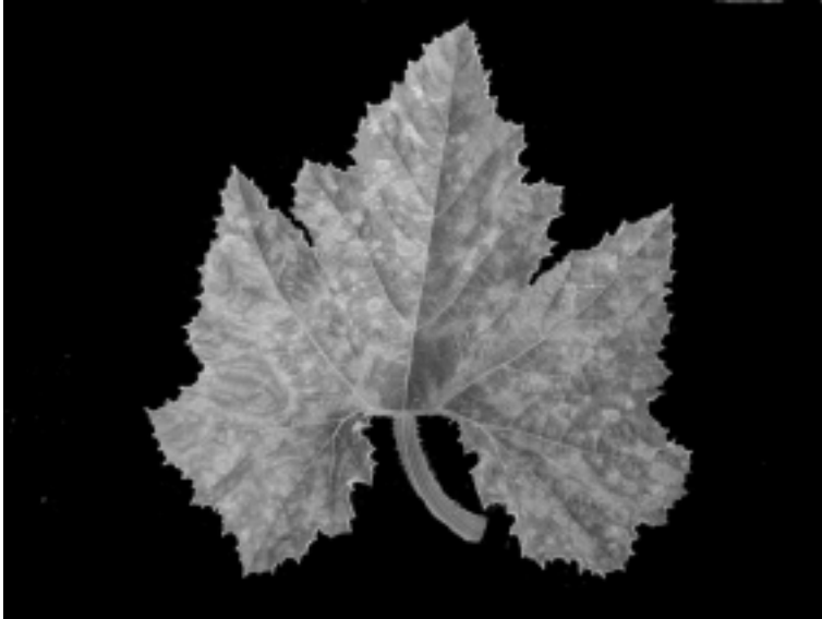
Fig. 1. — Intensive yellow-green mosaic and chlorotic mottling of leaf (sample 28) caused by zucchini yellow mosaic potyvirus