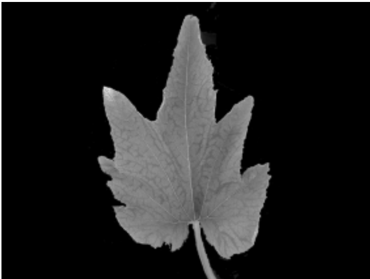
Fig. 4 — Yellowing and green veinbanding of leaves (sample 38) caused by zucchini yellow mosaic potyvirus