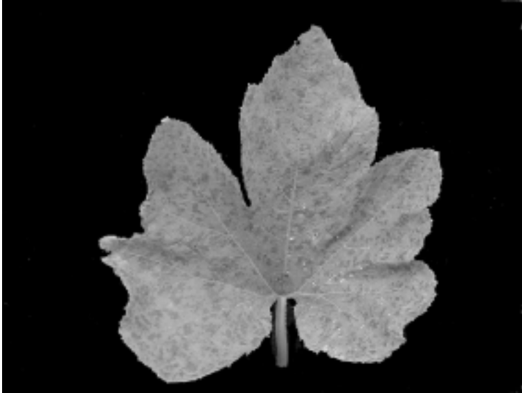
Fig. 3 — Chlorotic mottling of leaves (sample 21) caused by watermelon mosaic potyvirus 2