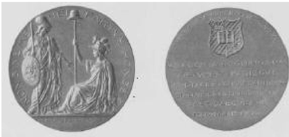
Fig. 7 The memorial medal that the University of Groningen had had struck for the celebration of its tricentennial in 1914. From [20].