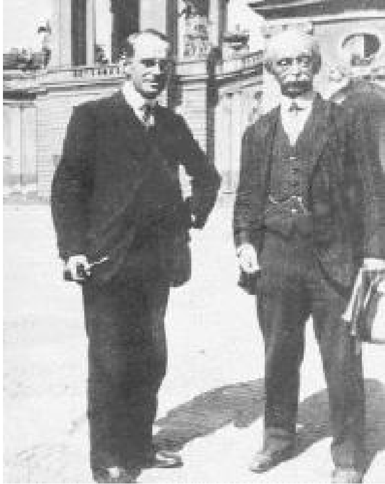
Fig. 10 Arthur Eddington and Jacobus Kapteyn. It is not known when, where and by whom this photograph has been taken. Oort was presented with a copy of this by S. Chandrasekhar. For the full story see [24]. It would seem that this photograph has been taken around 1920.