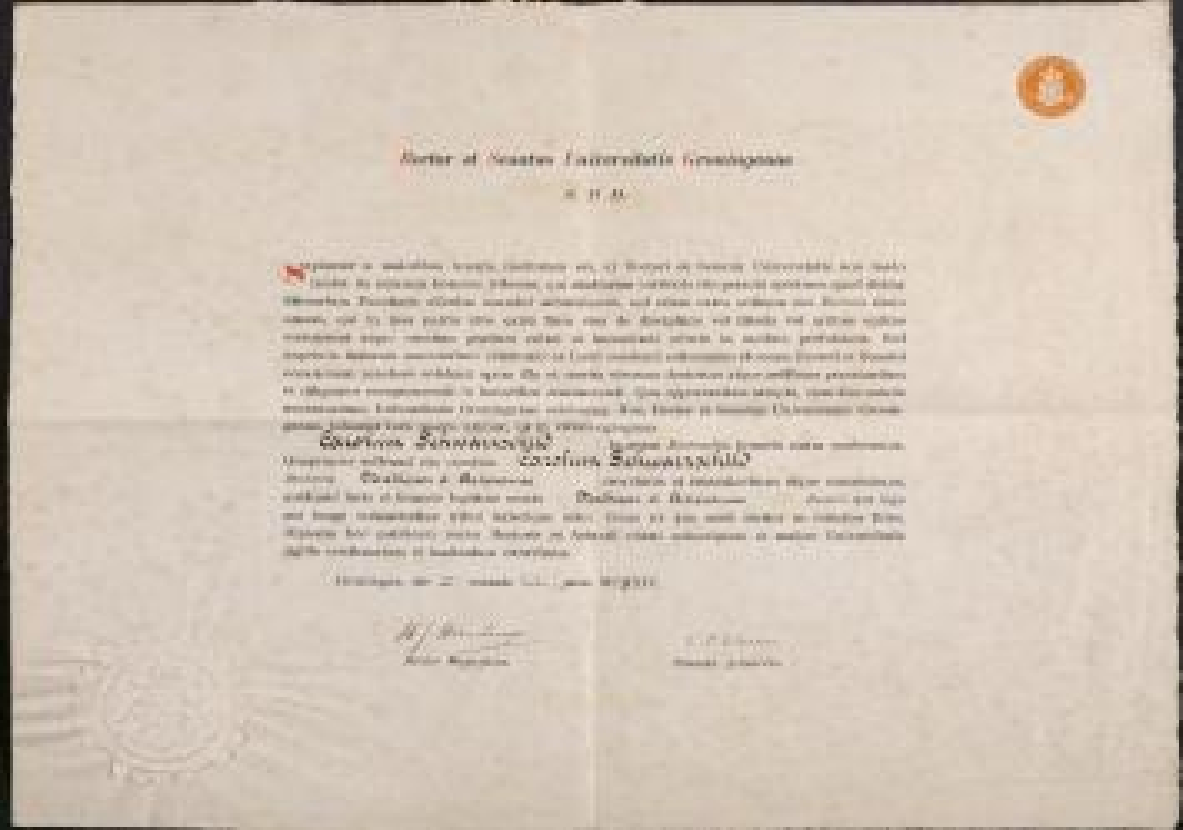
Fig. 6 Diploma or ‘doctoral bull’ for the honorary degree of Karl Schwarzschild from the University of Groningen in 1914 [14]