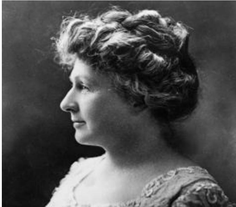
Fig. 8 Annie Jump Cannon in 1922.

who in our country successfully raised music to a higher standard.’ He was promoted to doctor of arts.