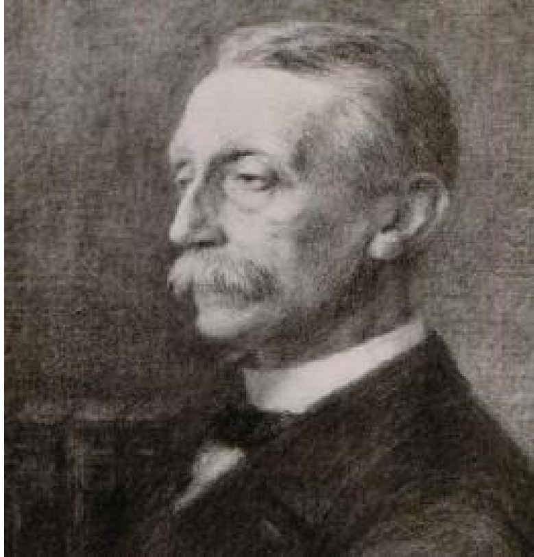
Fig. 1 Jacobus C. Kapteyn from a drawing in 1908 by Cornelis Easton. Kapteyn Astronomical Institute.

Of course the presence of the Streams significantly complicated Kapteyn's use of secular parallaxes, but did not make it impossible.