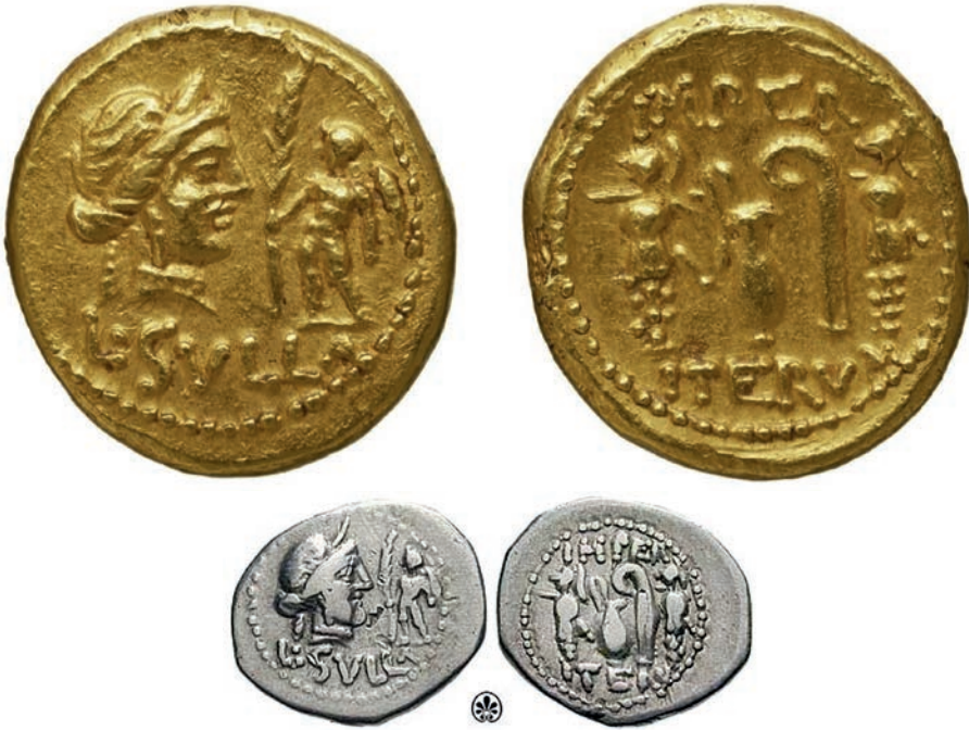
Figure 2: Aureus (10.81g; above) and AR denarius (below) of L. Cornelius Sulla (moving mint; 84/3). Obv. Head of Venus looking right, with eros standing in front of it looking left with palm-tree branch. Inscription L(UCIUS) SULLA below, all within a border of dots. Rev. Two trophies left and right, with lituus and jug between them. Inscription IMPER(ATOR) above and ITERU(M) below, all within a border of dots.

Roman Senator and close companion of Sulla. 37 Another pseudo-Athenian stephanephoros coin bears an owl standing on an amphora, framed by two trophies left and right – the trophies of Sulla’s victories at Chaironeia and Orchomenos – all within wreath. 38 One must note, in this case, the absence of the ethnic of the issuing authority.