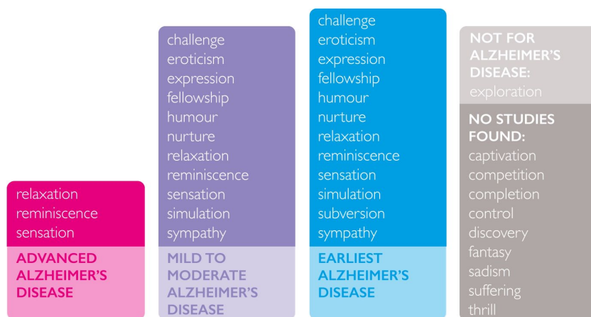
Figure 3. Play experiences for people with AD.

to define their target group according to the level of AD because the experience of playing varies widely along the course of the disease. As we have shown in our paper, a broad variety of play experiences can potentially be successfully elicited in persons with AD. In addition, stimulating affected brain areas possibly slows down the neuropathology in that particular area according to the “use it or lose it” principle (Swaab, Dubelaar, Scherder, van Someren, & Verwer, 2003). We strongly encourage game developers to design games for persons with AD that contribute to a meaningful and fun way of spending their time. To design games that match the players’ cognitive abilities, but are also challenging and stimulating, could best be achieved through collaboration between game developers and AD specialists.