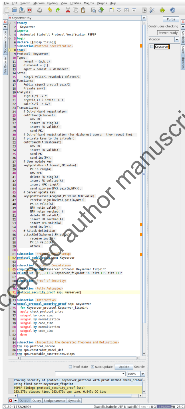
Figure 1: Using Isabelle/PSPSP for verifying a toy keyserver protocol.