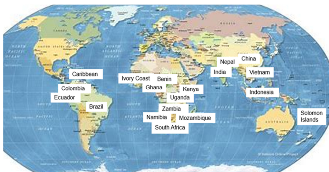
Figure 2. FFPLA Country assessments and implementations addressed in this Special Issue.

In recent years, the FFPLA concept has been introduced in many countries throughout the world for providing secure land rights at scale, within a short timeframe and at affordable costs. Figure 2 shows the range of countries where FFPLA assessment and implementation are addressed in this Special Issue.