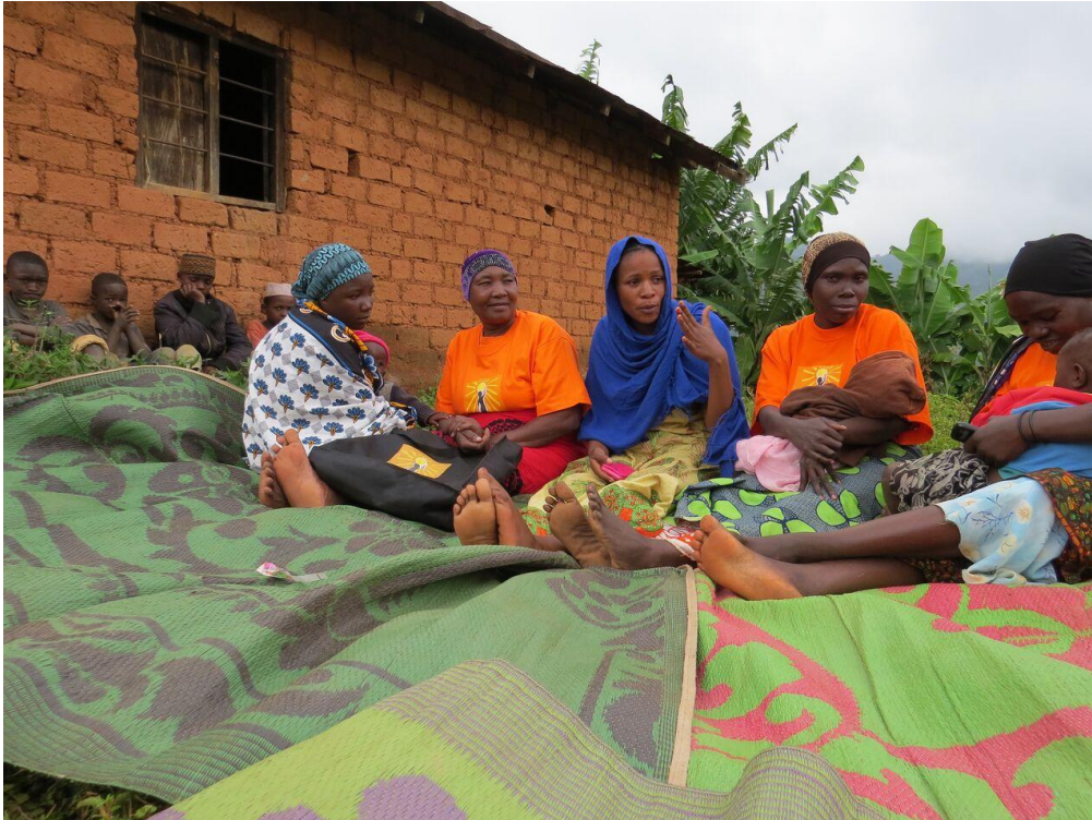
The Shashui entrepreneurs listen to a customer, center, explain how solar lanterns have changed her life