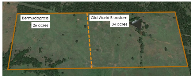
Figure 3. Forage community assessment.

The first step was to assess the forage community in the pasture, the producer noted that the west side of the field was dominated by bermudagrass and the east side was populated by old world bluestem stands. Based on observations, he concluded that the pasture needed to be divided into two sub-pastures as illustrated in (Figure 3).