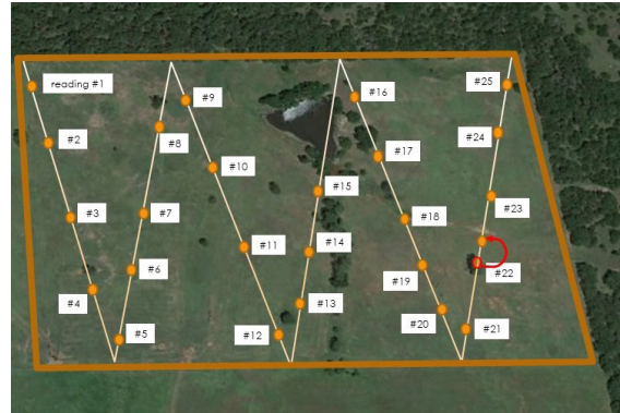
Figure 4. Reading collection plan.

The second step was to develop a reading collection plan for the east sub-pasture. Due to moderate variations in forage stands, he decided to take 25 readings every 75 steps in a zig-zag pattern. His reading plan collection is illustrated in (Figure 4).