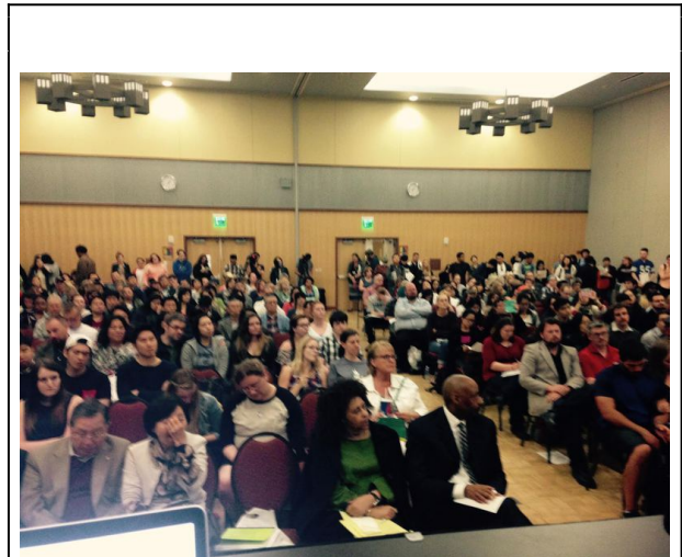
The audience of about 300 persons for the academic panel in the ballroom.

those coerced in sexual slavery as comfort women. Not because they are all the same, or can all be considered without regard to measures of complicity, but because they all demand our sustained attention if we have any hope of escaping the cycles of revenge and mutual recrimination that still seem to plague the Asia-Pacific seven decades after the war’s end.