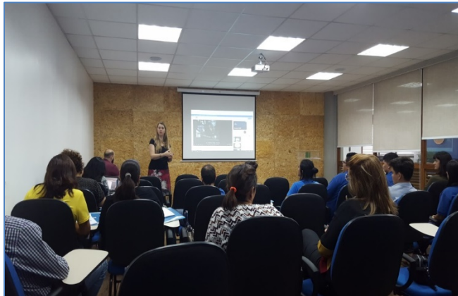
Figure 4. The first workshop.

The first workshop for the production of distance learning courses in the UNA-SUS planning model took place in October, where questions about the demand for professional qualification, identification of the target public, construction of a Pedagogical Action Plan and various pedagogical issues were addressed (Figure 4).