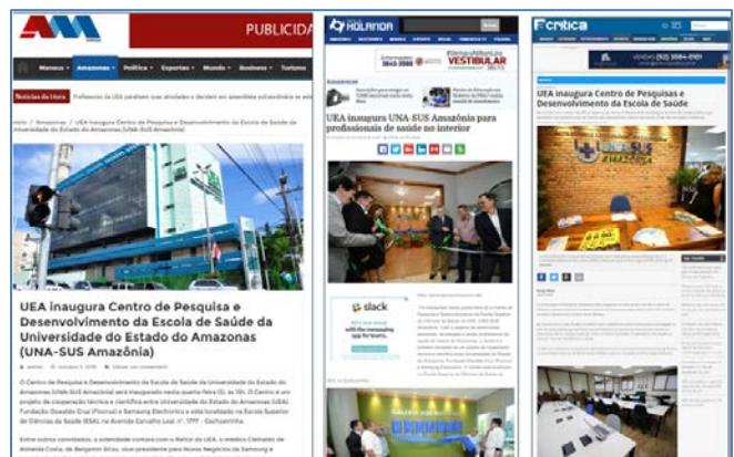
Figure 3 - Press release of the inauguration UNA-SUS Amazônia.

The inauguration of the Research and Development Centre of the School of Health of the University of the State of Amazonas, a member of the UNA-SUS network, was widely publicised in several newspapers and magazines in the city. (Figure 3)