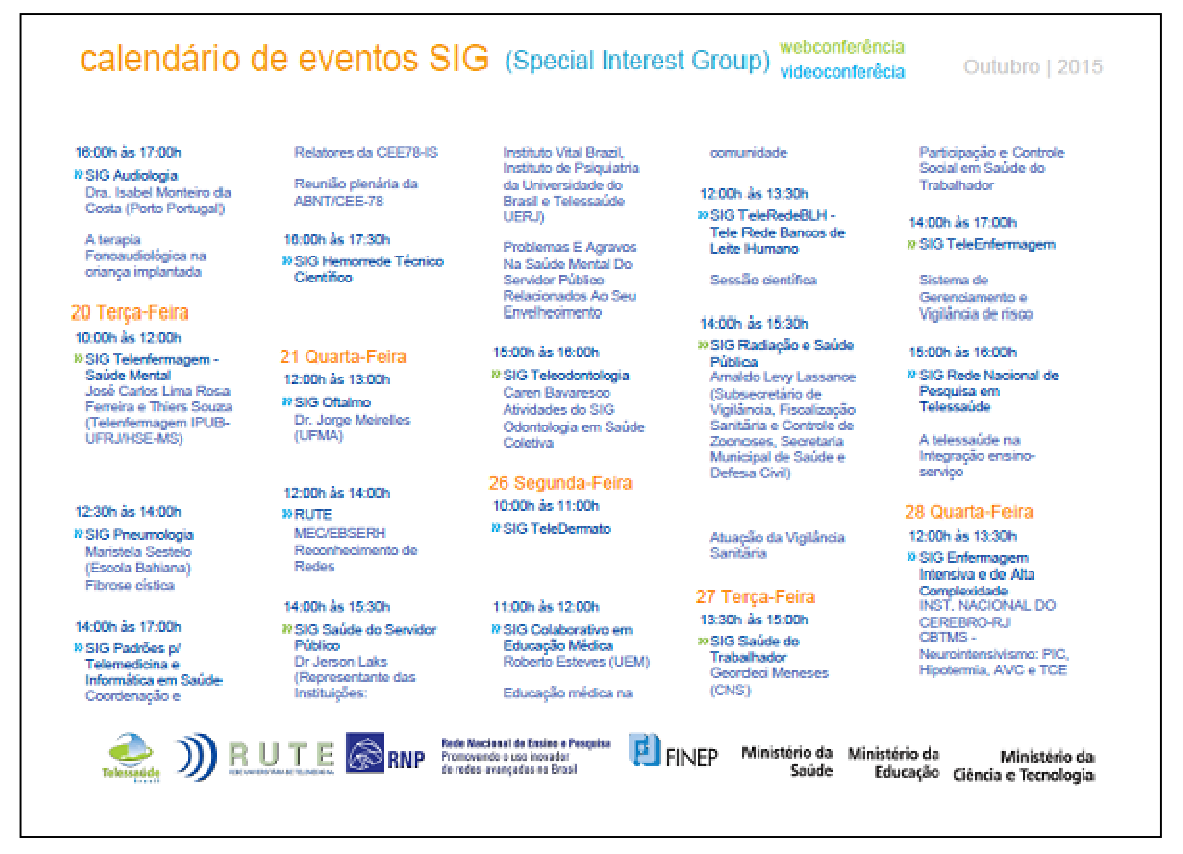
Figure 1. Sample of SIG's agenda Oct 2015.

100 RUTE units and 55 SIGs were invited to answer an online survey about their current status. These data were used in a process of graphical data visualisation to represent the social network analysis of RUTE, focusing on the role of coordinating SIG units. Three main highlights are noted from the graphs, and are discussed as relevant results. The RUTE units