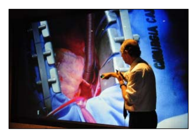
Figure 2 . The 4K technology allows the generation of images with resolution four times higher than that of Full HD.

From April to July 2014, coordinators of the first