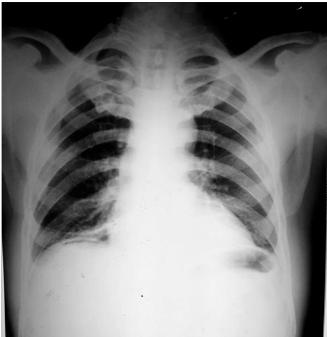
Figure 2. Chest x-ray PA view showing gas under right diaphragm.

examined. The history was again suggestive of an ACS. The first ECG did not have ST-elevation of > 2 mm in two contiguous chest leads, so we withheld the decision to thrombolyse and ordered cardiac marker concentrations. His creatinine kinase (MB) concentration was 14 U/L which were much below the reference range for ACS, i.e., < 24 U/L. The repeat ECG, done in emergency at our Centre, did not show any progression of ST-elevation, but the chest pain was persistent. A routine chest x-ray, also done in emergency at our Centre, revealed something unexpected, i.e., gas under the diaphragm. (Figure 2)