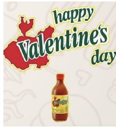
Figure 2. Sticker.

For users, visual elements were better equipped to capture certain meanings than oral or written statements. In this way, visual elements can acquire a completely different meaning. For example, participants in the third stage of our research shared with us this sticker they used on February 14 (see Figure 2).