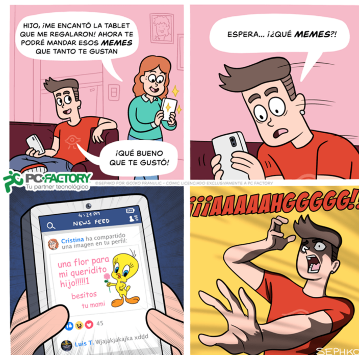
Figure 4. A young man receives the infamous "Tweety meme" from his mother, who just got a new tablet. The meme says, "A flower for my beloved little son. Little kisses, your mommy".

There is a common joke in Latin America about the nature of certain groups where people send content that is deemed "cheesy." Users typically refer to this content through a stereotypical image: a meme of Warner Bros' Tweety allegedly sent by family members (usually women). Figure 4 shows how a Mexican technology provider sought to capitalize on this joke. According to our younger informants, this form of unsolicited content also includes greetings with religious undertones (the so-called bendición , or blessing) or phatic messages to say phrases such as "Good morning!" or "great day!" examples of a growing digital "kinship" (Sinanan, 2019).