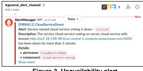
Figure 3. Unavailability alert

first one informed the internal team regarding the unavailability of the sample application (Figure 3). The other two alerts informed the certification authority and the customer after 15 minutes of continuous unavailability as it could, for example, be demanded in an SLA between the cloud service provider and the cloud service customer.