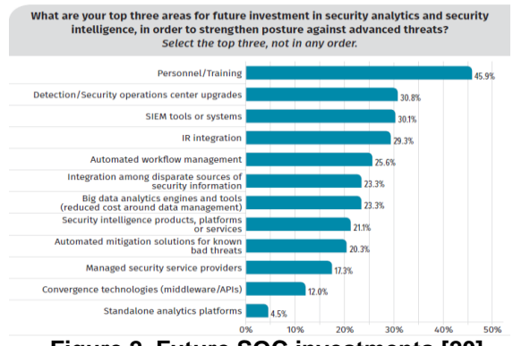
Figure 2. Future SOC investments [20]

Referring to Figure 2, we can see the top areas SOCs plan to focus future monetary investment in. Although this can be viewed as future solutions to current problems, it provides insight into what the future problems of SOCs will be.