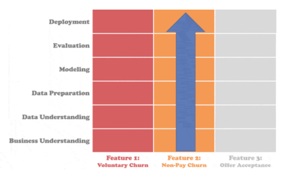
Figure 2: Vertical Slicing

Then, based on stakeholder needs, the next step could be to develop an automated system for the first model, or improve the first model (possibly with new data sources), or develop a model for the second deliverable. In other words, the first iteration provides just enough value to proceed to a decision point that leads to multiple possible paths. Numerous, small, vertical slices align the data science team's work with business value.