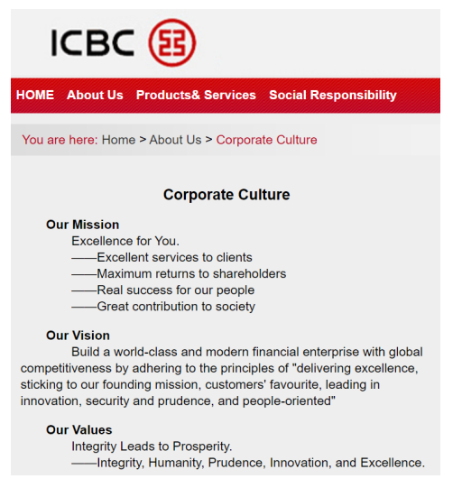
Figure 2. Mission and Vision Statements of the Industrial & Commercial Bank of China.

An example of such an identified statement is given in figure 2. The result of this data collection phase was a folder with vision screenshots. To ensure