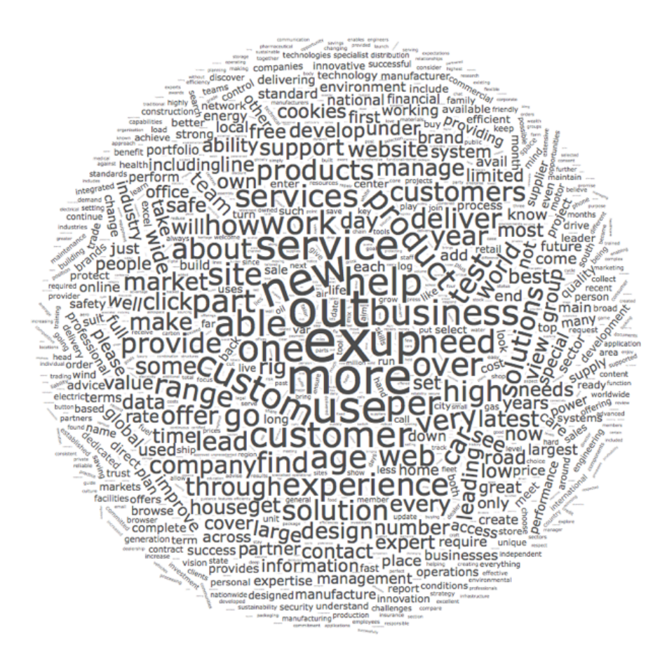
Figure 3. Word cloud showing frequency of words registered by websites in the extended word list.