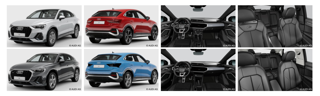
Figure 1. Exemplary Audi Q3 Sportback configurations (from left to right: exterior front view, exterior rear view, interior front view, interior rear view). The upper row displays correct configurations whereas the lower row depicts defective ones. We remove the copyright sign during preprocessing.