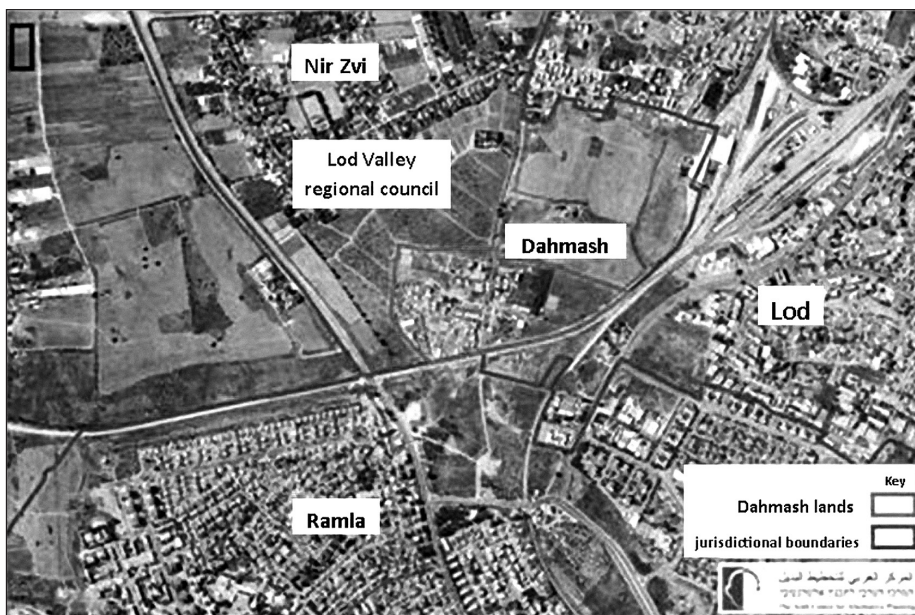
Figure 1: Dahmash and its neighbouring settlements.

during the Nakba in 1948 (the Palestinian dispossession during the establishment of Israel; on this common practice, see: Falah, 1996). Some bought their land from its previous owners. Although the residents own most of the land, since 1984 it has been designated for agricultural use only, rendering the buildings illegal (Ministry of Interior, 2013). As a consequence, Dahmash has no amenities such as water and sewage, street lights, electricity, roads and waste collection (ibid). The residents have no residential address but some are registered in the neighbouring city Ramla, where they receive welfare services and the children attend school. These services are presented as a matter of fact by the state (High Court 5435/14:4, section 16), although they are also contested and in some cases the local authorities refused to provide transportation for pupils or education for an infant with special needs until the matters were settled in court (Minor vs The State [2009], AN 2399/08). The settlement is therefore informal in the sense that it is not recognised as an entity by the authorities, is not connected to basic amenities, and is illegal (Roy, 2005).