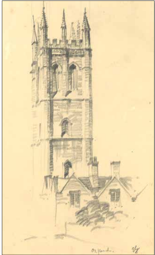
Gilbertson drew sketches in the margins of his letters, but also preserved them in more than 80 drawings such as this one from England.

[editor note: *semi-autonomous city-state between Poland and Germany]