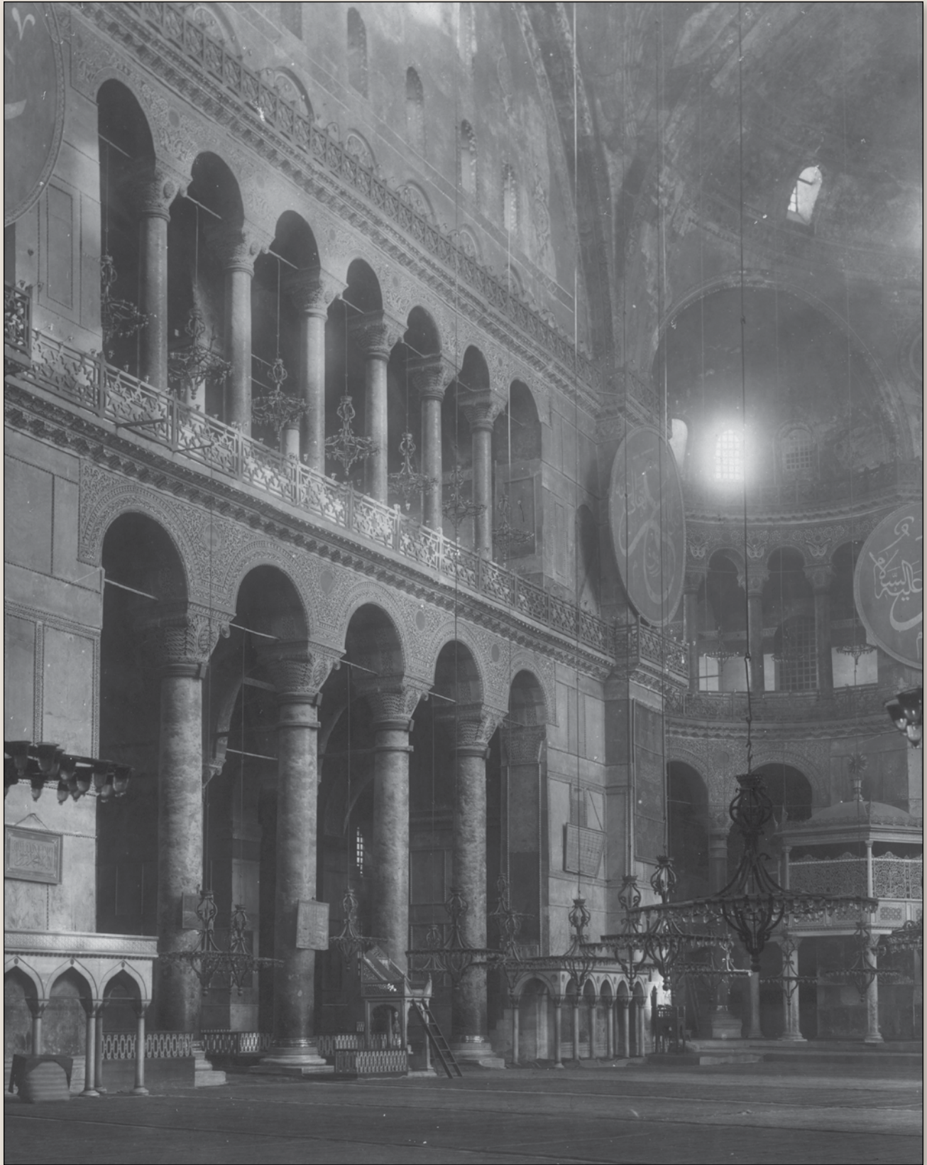
Workers document Hagia Sophia mosaics.