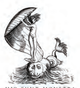
HIC SVNT MONSTRA