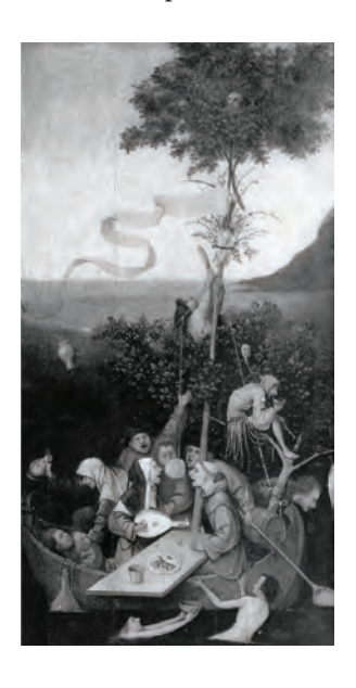
Fig. 1. Hieronymus Bosch, Ship of Fools (1490–1500)