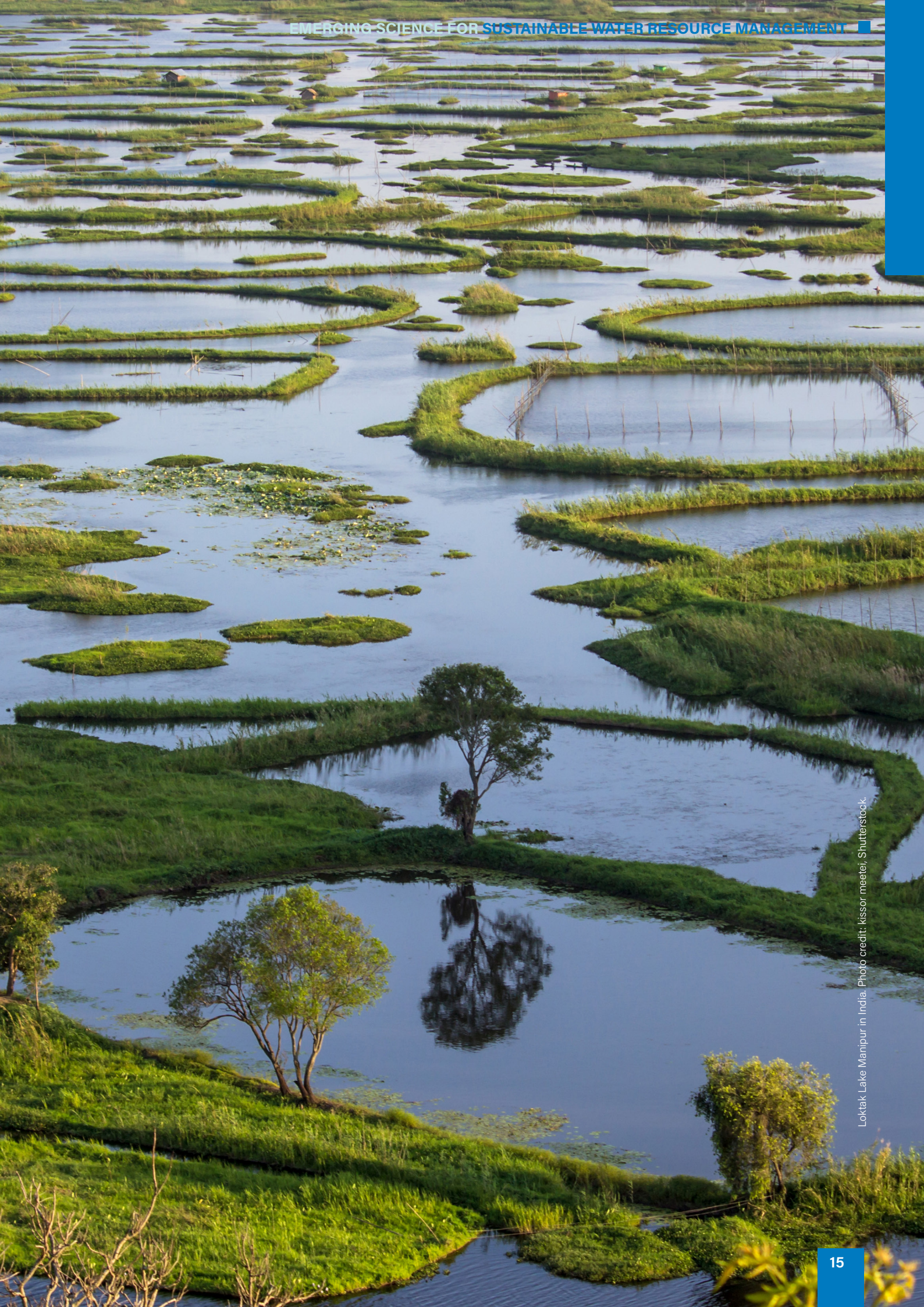
Loktak Lake Manipur in India.