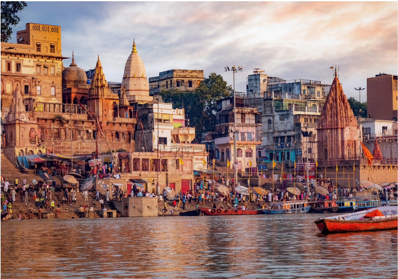
Varanasi, along the River Ganges.

A shift in focus from water supply management to water demand management is needed (Jain 2019; NITI Aayog 2019). In many cases, an over-reliance on groundwater for drinking and irrigation is causing significant declines in groundwater levels and groundwater quality across India, yet much of the irrigation in place for food production is wasteful (FAO 2015; Jain 2019). Part