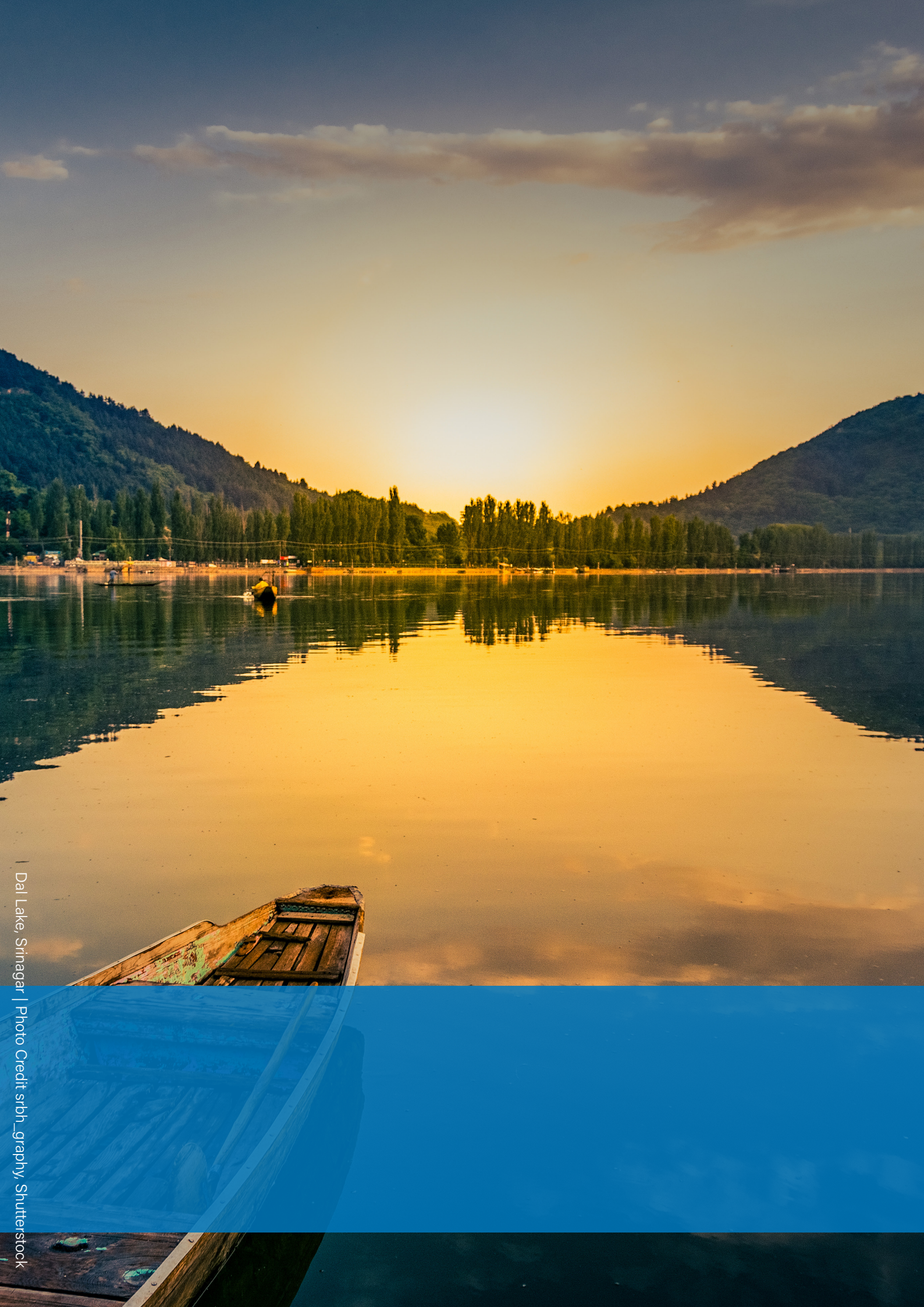
Dal Lake, Srinagar