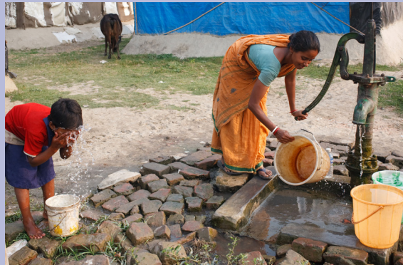
Kolkata, India.

dwelling facing water scarcity globally may increase from an estimated 933 million (33% of global urban population) in 2016 to 1.693-2.373 billion (35-51% of global urban population) by 2050, according to the four socioeconomic and climate change scenarios they considered, with India appearing to be the most severely affected (increase of 153 to 422 million people).