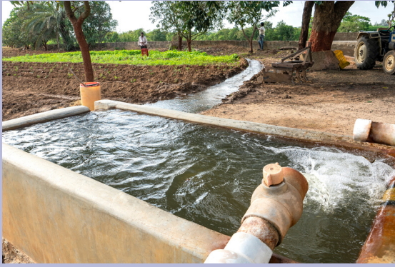
Kochi, Kerala, India.