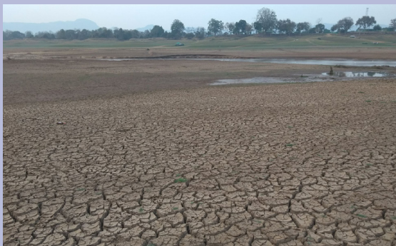
Low water levels, Tawa Reservoir, Madhya Pradesh.