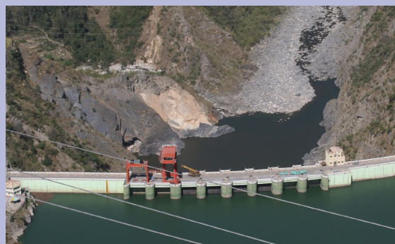
Chamera Dam, Himachal Pradesh.

20% more of the world's population being at risk from floods in 2050 compared to today (WWAP 2019). India experienced an average of 17 flood events per year over the 20 year period from 2000-2019 and is considered the second most affected country by floods (CRED 2020).