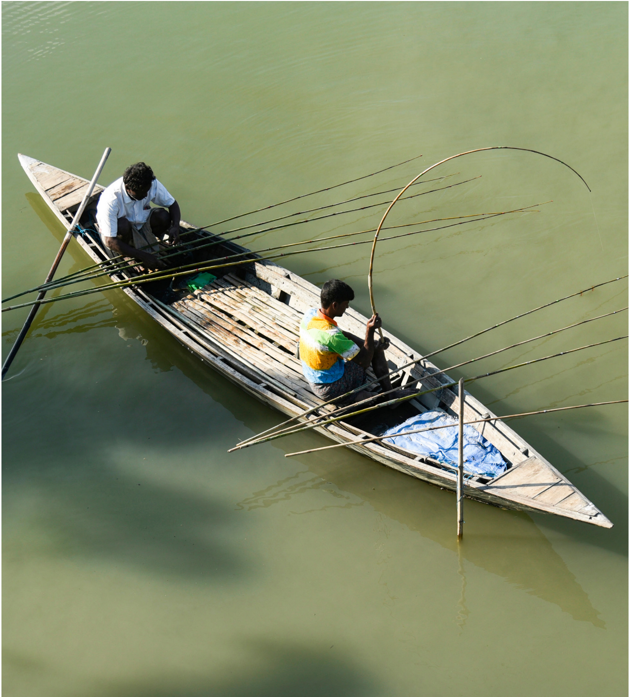
Fishermen in Barpeta district, Assam.

step forward to looking at water as a whole and not its separate parts (Chaturvedi 2012; Jain 2021). Similarly, the establishment and monitoring of the Composite Water Management Index by the National Institution for Transforming India (NITI Aayog), which has outlined the current status of water resources as well as the performance by States, is another important development. NITI Aayog (2019) recommends the use of data-based decision making, which could prompt States and