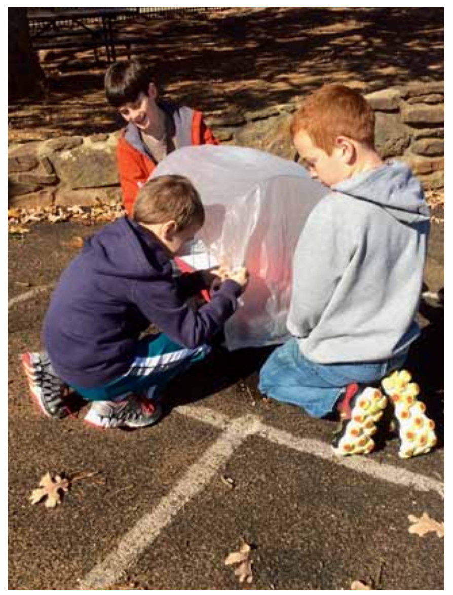
Figure 3. Elementary students add plastic cover to the greenhouse in preparation for planting.