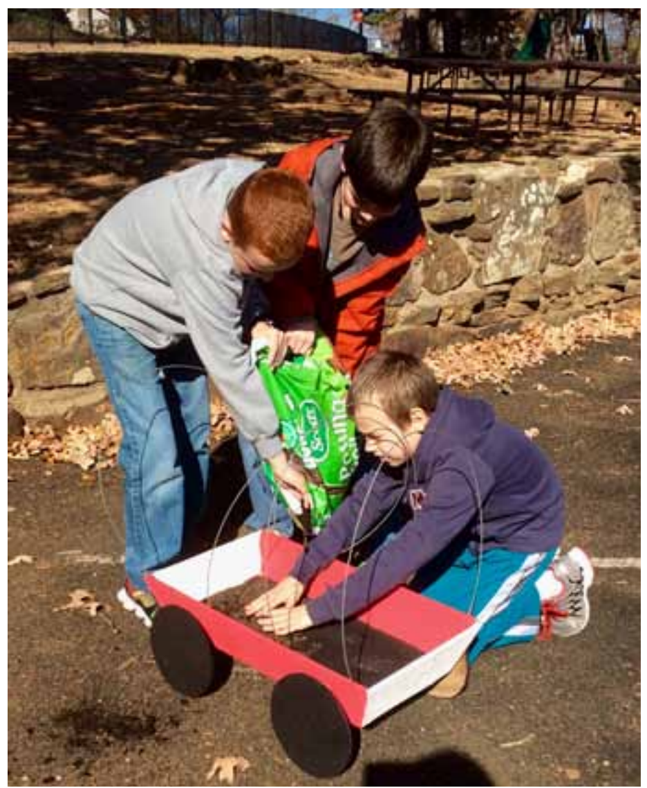
Figure 2. Elementary students add potting soil to planter.

6. Bend the wire hangers in the shape of a horseshoe, and poke both ends into the soil right up against the sides of the planter. This will make a rainbow-shape over the planter that resembles the top of a covered wagon.