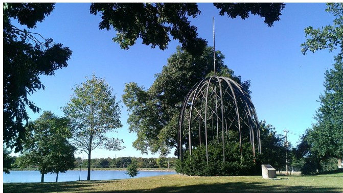
Figure 7. The Courthouse Dome

Appearing much like a sculptural work of art, the large metal structure that sits to the south of the pavilion was once the framework for the courthouse dome (fig. 7). After being brought to the park, the dome was originally encased in wire mesh and used as an animal cage before eventually being used in its present manner as object d'art and historic artifact (McLean County Museum of History: Miller Park Archives). There is a plaque in place that explains the origins and history of the dome, near its base. It is an element of contrast against the rolling lawn on which it sits, with the lake as its backdrop (observation notes 2013).