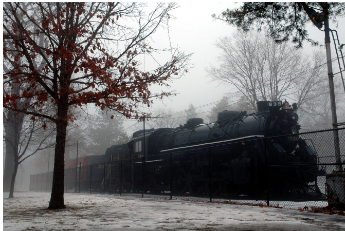
Figure 10. The Nickel Plate Railroad

whistle that was once used in Bloomington's trainyards; with a plaque commemorating its use and its dedication by local labor unions on Labor Day 1982. The train and steam whistle, appear as reminders of a previous time in American history, specimens of earlier culture and of curiosity to children and adults alike (observation notes 2013).