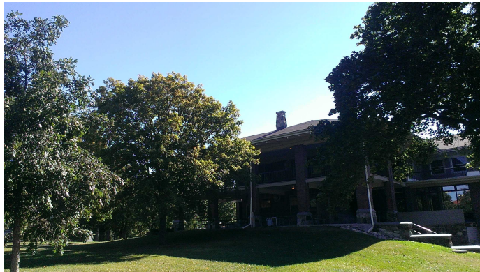
Figure 9. Miller Park Pavilion

the years, at more than 100 years old, it still appears much as it did in its original form (Proeber 2006). The pavilion has been the location for numerous cultural events throughout its history, including band performances, cotillions, and dances (cityblm.org). Recent cultural events within the pavilion have included a spaghetti dinner, orchestral performances, and a Christmas celebration. Among it's current uses, the pavilion serves as an election day polling location, hosts yoga classes, parties, receptions, community meetings, and houses a senior citizen center with outreach and recreation programs in the basement (cityblm.org).