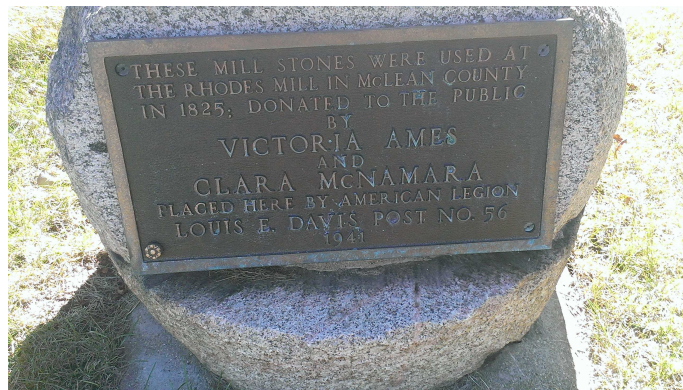
Figure 8. Rhodes Mill Stones