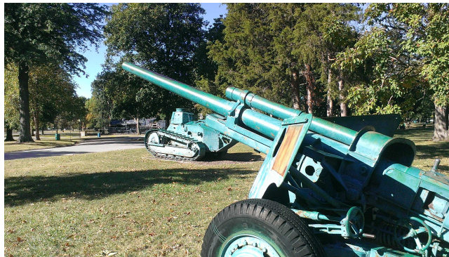
Figure 3. World Wars I and II War Implements

The World Wars I and II war implements, (fig. 3) parked along the Wood street border near its central entrance, act as monuments to the wars and again to those soldiers who fought and served during those wars. The guns appear as a physical reminder of war but do not give the feeling of memorial or somber reflection found at the other two war monuments within the park (observation notes 2013). Unlike the other memorials within the park, there is no list of names of the war dead near these implements, which include an artillery canon and two different types of tank vehicles. A plaque that had once been affixed to one of the guns is now missing, likely due to theft or vandalism (observation notes 2013).