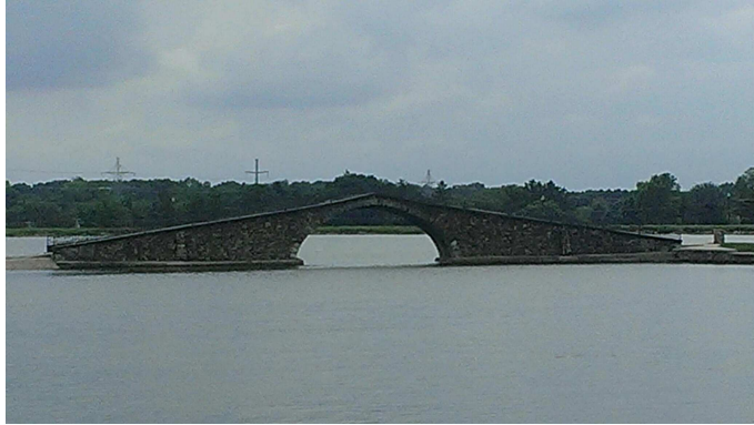
Figure 6. The Pedestrian Bridge

Appearing much like a sculptural work of art, the large metal structure that sits to the south of the pavilion was once the framework for the courthouse dome (fig. 7). After being brought to the park, the dome was originally encased in wire mesh and used as an animal cage before eventually being used in its present manner as object d'art and historic artifact (McLean County Museum of History: Miller Park Archives). There is a plaque in place that explains the origins and history of the dome, near its base. It is an element of contrast against the rolling lawn on which it sits, with the lake as its backdrop (observation notes 2013).