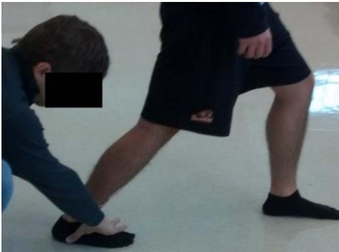
Figure 3. Hand Placement for FMR Stabilizing Ankle and Mobilizing Leg

FMR treatment was performed on the ground in weight-bearing with the treatment leg positioned posterior to the contralateral leg in a lunge position. The researcher applied an anterior glide to the tibia through the palm of the hand placed immediately superior to the malleoli while additionally externally rotating the lower leg. Simultaneously, the subject alternated leaning toward and away from the clinician. The final component occurring during this treatment involved the subject holding onto a door frame with the contralateral arm for support and additional rotation. 16 Three sets of 15 repetitions were applied to the subject with 1 minute rest between sets.