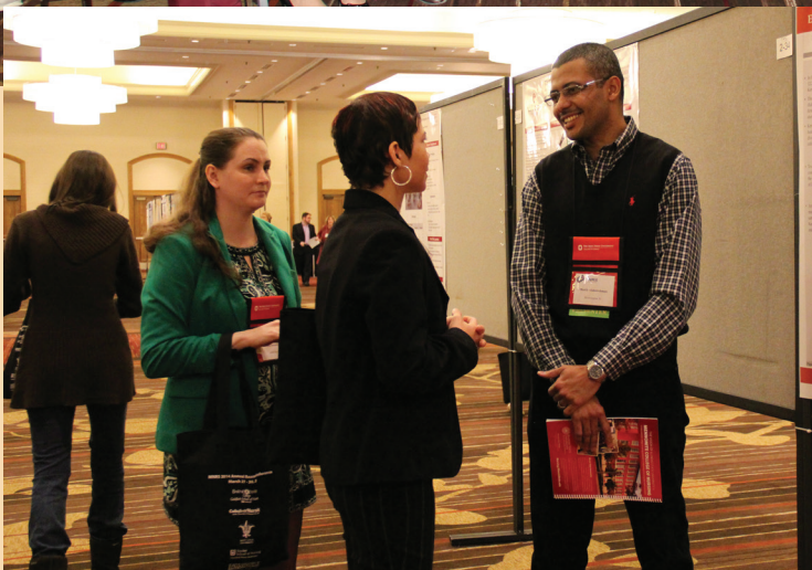
2014 Midwest Nursing Research Society Conference