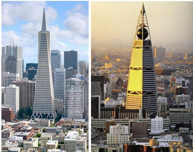
Figure 2 - Architectural Similarities between the Transamerica pyramid in San Fransisco (left) and Al-Faisalia

AlMamlakah on the other hand is bigger in size and more modern. The structure is smoothly constructed and reflects the rays of the sun during the day and glitters at night with lights. It has no head but a V-shaped hollow at the top. It resembles a woman wearing a beautiful dress, which emphasizes the chest. It mirrors a futuristic and liberated woman who is aware of her physicality and is proudly displays her sensuality. This structure lays more emphasis on the physical aspect than the intellectual that is underplayed but nevertheless present. The “V” shape could have a possible link with Da Vinci Code, which also revolves around symbolism of the feminine in history. The “V” could symbolize the Holy Grail and the Chalice that is again a symbol for a woman’s womb, which bears “the blood of God”. This has a sacred and holy connotation in Christian belief and most probably in middle-eastern culture as well since the two have intertwined roots of origin. The female figure connects with the world through her ability to breed, connecting her physical body with the spiritual. The sensual connection of mother to child was disrupted in history where the father, in his attempt to connect with the female sensuality, names the child after