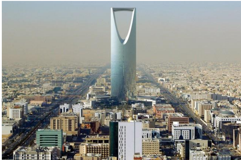
Figure 3 - The Kingdom Tower, Al-Mamlakah (302.3m)

It is through a discovery of sexuality and its power AlMamlakah is a symbol and a sign that is culturally unrecognized by the public. The female (AlMamlakah) in this respect remains connected in her high status with the heavens. This is to be contrasted by AlFaisalia where the woman depicted is more intellectual, but minimally sensual. She is made unaware of her powers and restricted—so restricted to the point of worrying about her existence (the ball does not light at night). If the ball is inspired by the pen, then, there is a possibility that it is a direct reference to the historical fact where women were not allowed to get an education (write). This is also true to the history of women in the west. During the time of Queen Victoria many female writers were either hiding behind a male writer such as Elizabeth Browning or using male pseudonyms to have their work published and then be recognized of producing such passionate works of art. At the time female writing was not highly appraised even if it was of higher quality. However, AlFaisalia casts a shadow due to its shape—a past which is known and can be reflected upon to find a meaning of this existence.