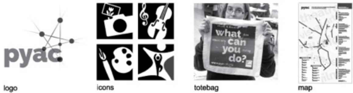
Fig. 2, visual outputs, visit the website at: www.pyac-ri.org

Together with my design team we created an icon family to represent the PYAC's offerings. The icons communicate on a purely visual level and are core elements to the visual identity.