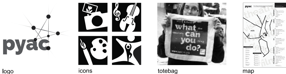
Fig. 2, visual outputs, visit the website at: www.pyac-ri.org

The primary element of the visual identity is the visual language and logo. The logo I designed represents the six members of PYAC through the use of six dots, which are connected by gradient-filled lines forming a network that expands into space to create a metaphor for idea exchange. The star suggests that their unity is greater than their individuality.