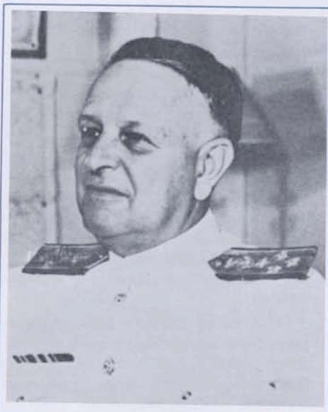
Admiral Husband Kimmel

not take adequate precautions. Their job had been to protect the fleet and they failed.