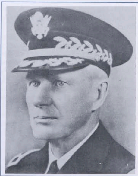
Lieutenant General Walter C. Short

Some revisionists respond that Roosevelt was willing to sacrifice obsolescent battleships. But Roosevelt had no way of knowing that the Japanese would only attack battleships and not the more important, both strategically and logistically,