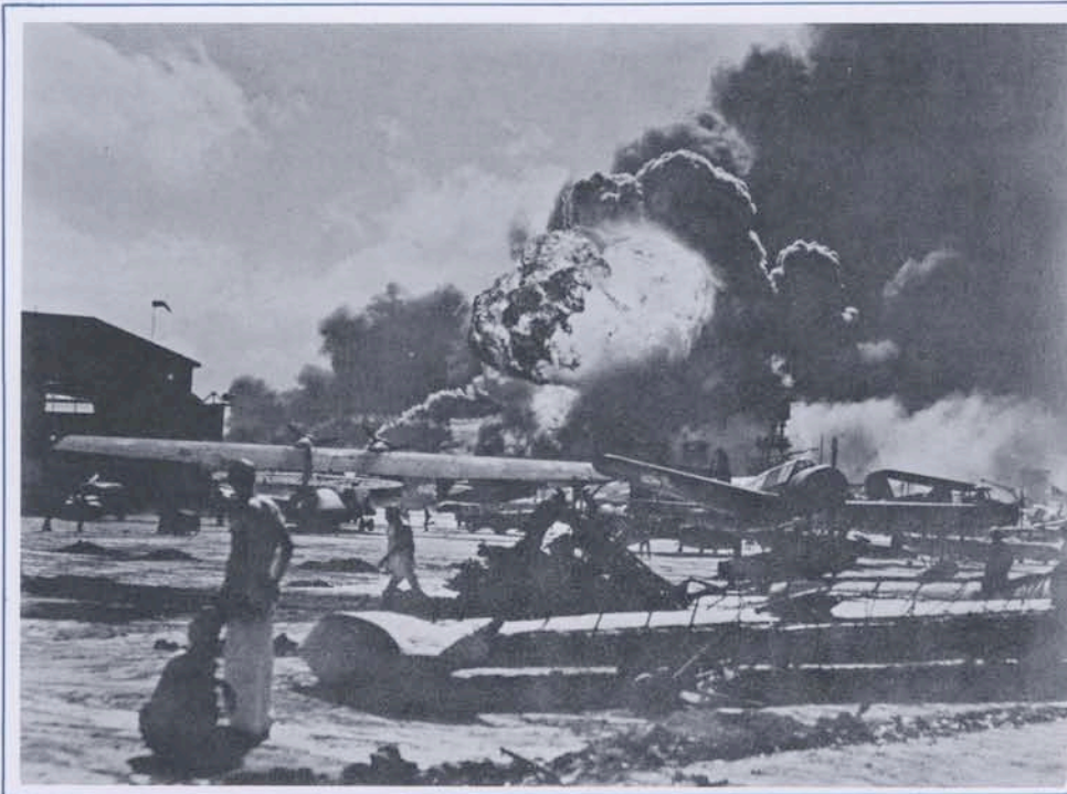
Planes and hangars at the Ford Island Naval Air Station go up in flames and smoke as the attack continues.

intelligence said it was, it could not be elsewhere.