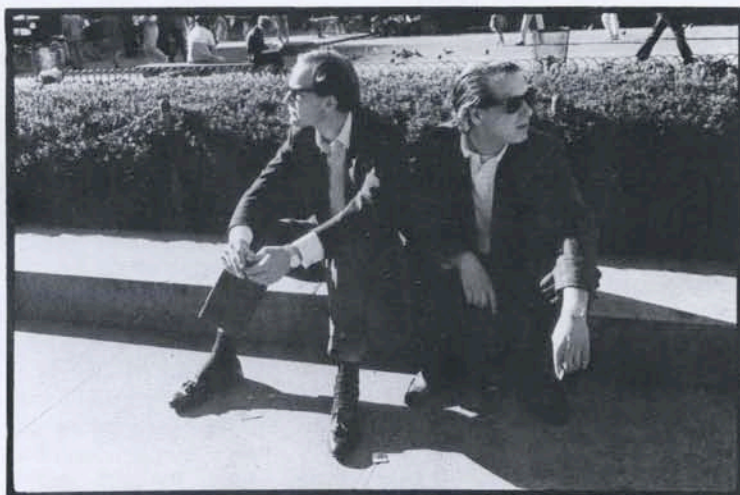
Outside Central Park

These photos were taken in New York City in the summertime. They were shot with a Leica camera, using wide angle lenses and Tri-X film. Any resemblance to actual events or real persons is entirely coincidental.