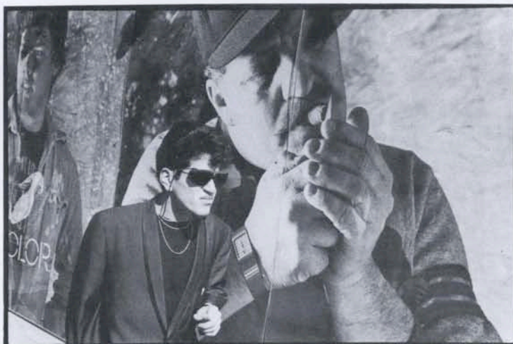
On Fifth Avenue