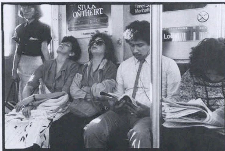
On the train to Shea Stadium