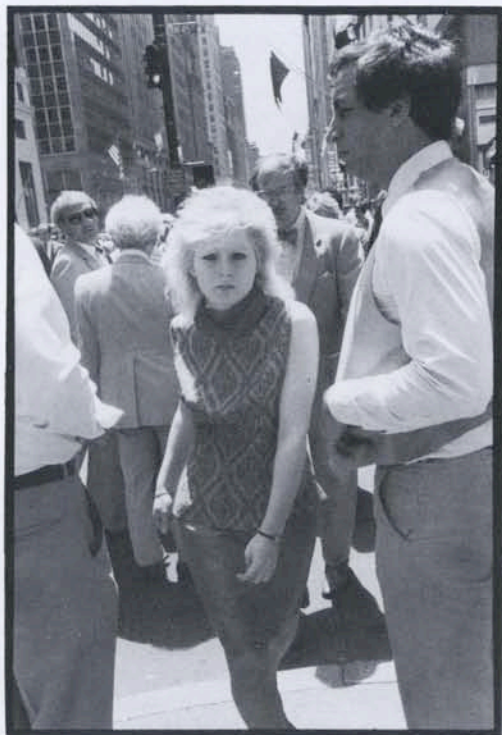
On Fifth Avenue