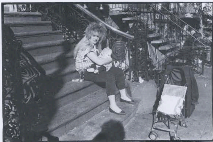
St. Marks Place in the East Village