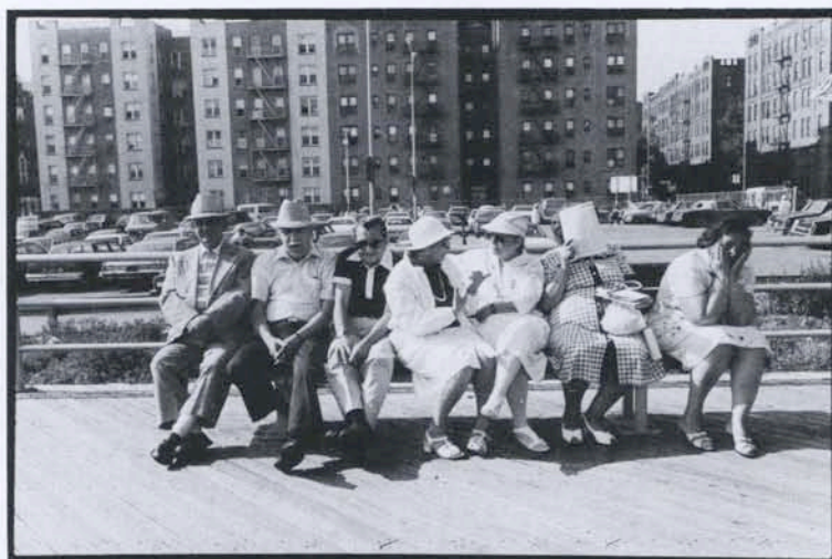
On the Boardwalk near Coney Island

These photos were taken in New York City in the summertime. They were shot with a Leica camera, using wide angle lenses and Tri-X film. Any resemblance to actual events or real persons is entirely coincidental.