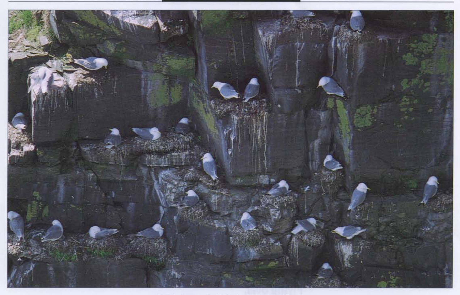
Kittiwakes on Bird Rock at Cape St. Mary's

Near the southernmost tip of Newfoundland is Cape Pine with its lighthouse built in 1851 to warn sailors of shoals and other dangers. Some 300 feet above water, one can hear below the haunting sound of a buoy anchored some distance offshore. A bellow system attached to the buoy's long anchor cable rises and falls, creating a plaintive wail which calls across the water.