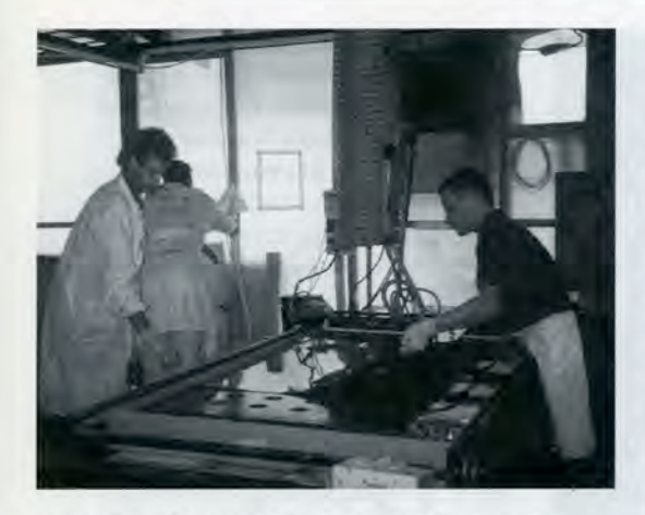
MIVAN, a Belfast Irish firm, produced gold panels. The workshop was on site beside the Dome of the Rock. This photo shows the pressure plating of 2 micron thickness of gold held in emulsion to panels which had already been plated with copper and nickel. Computer regulated quality control of the thickness of gold took place in an adjoining room.

The restoration provided the opportunity to examine parts of the building not normally visible. The tile window grilles of the dome drum removed for the restoration exposed the original Umayyad round-arched windows. The existence of holes in the stone on the sides of the arches suggests that, prior to the sixteenth century, there were originally metal, stone or marble grilles.