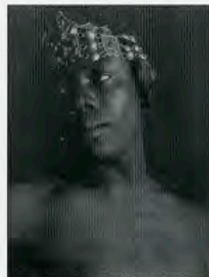
"Ethiopian Head Crowned," circa 1897, F. Holland Day, The Royal Photographic Society, Bath, UK

Following a 1904 studio fire that destroyed his negatives, art collections,