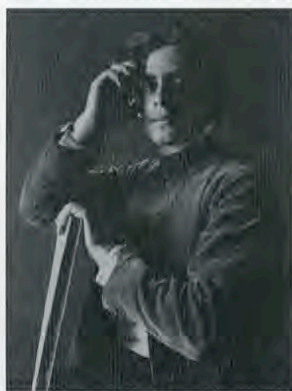
"Kahlil Gibran with Book," 1897, F. Holland Day, The Royal Photographic Society, Bath, UK

A major retrospective of Day's photographic oeuvre ended its run at the Museum of Fine Arts, Boston in March and this summer travels to museums in Amsterdam and Munich. It is a welcome re-examination of one of the world's master photographers in the Pictorialist tradition. Day's subject matter ranged from sensitive portraits and figure studies to allegorical depictions of classic subjects. Perhaps his best known works were his 'sacred' studies, including a bold series on the crucifixion of Christ for which he was his own model. All were well represented in the exhibition Art and the Camera: The Photographs of F. Holland Day . The exhibition also introduced to the public some of Day's philanthropic activity, a dimension of his career that deserves elaboration as it shaped both his life and his art.