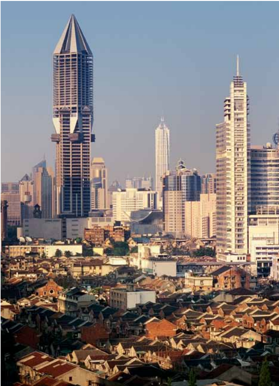
Old and New Shanghai, China

From their experience watching Mardi Gras: Made in China , students learned three important lessons: first, when the world is changing, no existing ideology can be used as a basis for judging change, reality and practice must be the sole criteria; second, rejecting the influence of ideology is key to globalizing ourselves; third, escaping the assumptions of our own culture is the beginning of opening our minds to other parts of the world.