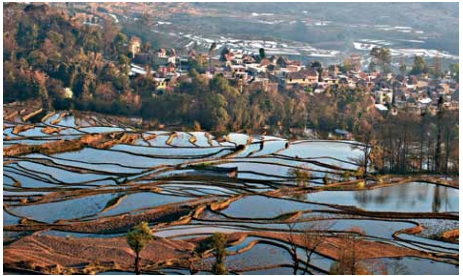
Terrace farming, Qinkuo, Yunnan, China

constitutes the global economy. These statistics show that a superpower can no longer exist without the assistance and collaboration of other nations. For instance, although Apple symbolizes the best of American big business—its innovative drive, its flair for style, and its advertising acumen—it has only succeeded because of its deep relationship with China, where nearly all of its products are assembled by workers who are paid on average $260/month. In addition, about 20% of Apple’s global sales revenues come from China. In short, isolated domestic markets simply do not exist anymore.