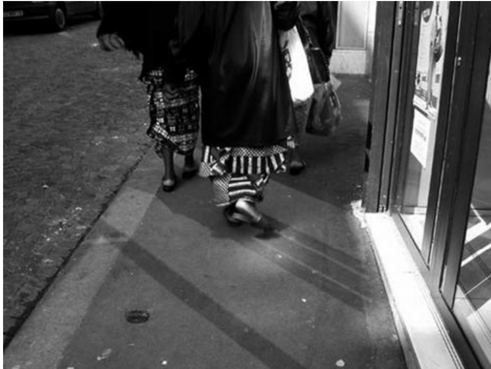
Image 5. Footsteps.