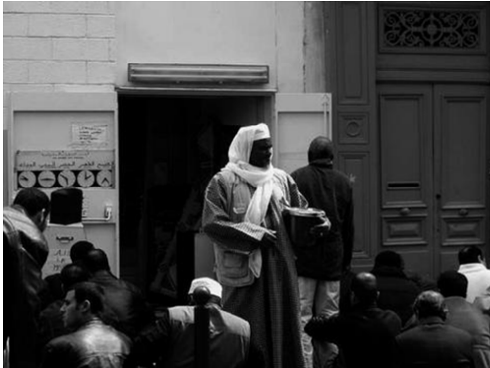
Image 3. Mullah.