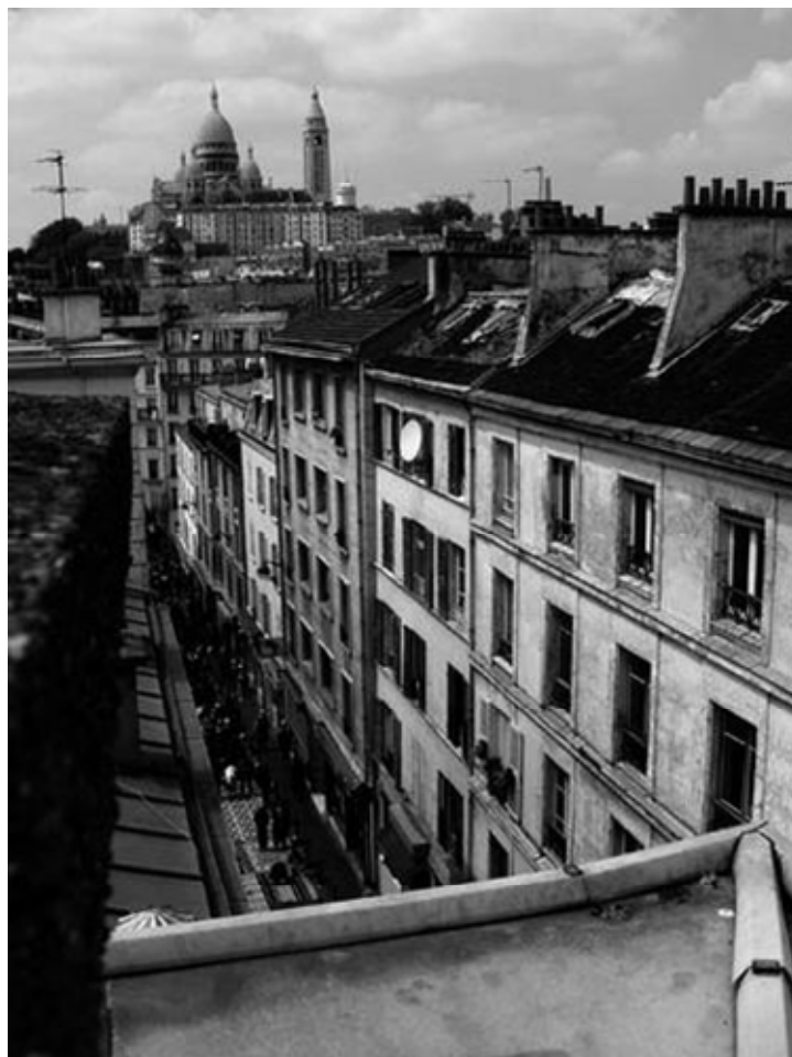
Image 1. Rooftop, Sacre Coeur.