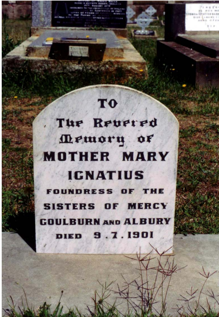
Figure 4. St. John's Clergical Cemetery, Guadalupe House (former St. John's Orphanage), Thurgoona, Albury, NSW., in 2004. Headstones of Mother Ignatius.