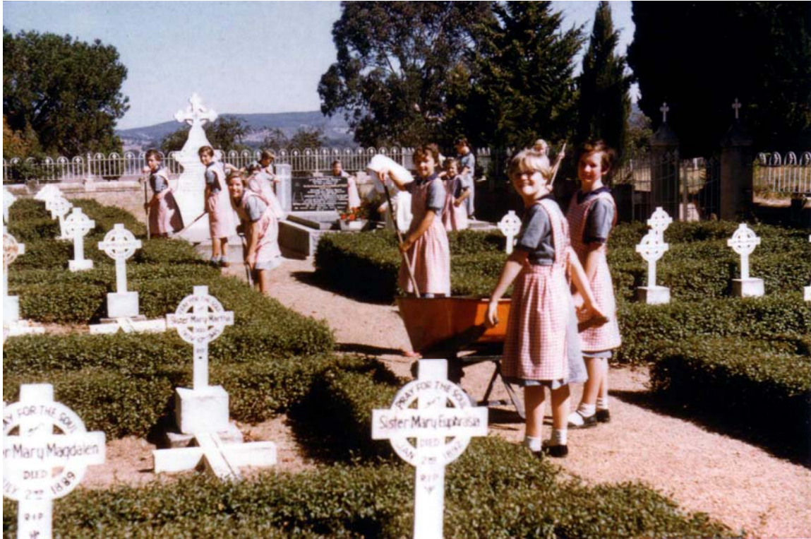
Figure 2. St. John's Clergical Cemetery, Guadalupe House (former St. John's Orphanage), Thurgoona, Albury, NSW., in the 1950s.