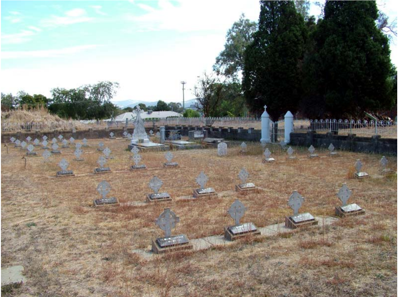
Figure 1. St. John's Clergical Cemetery, Guadalupe House (former St. John's Orphanage), Thurgoona, Albury, NSW., in 2004.